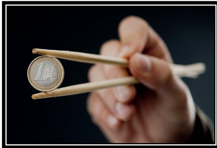
CHINA IS AN INVESTOR