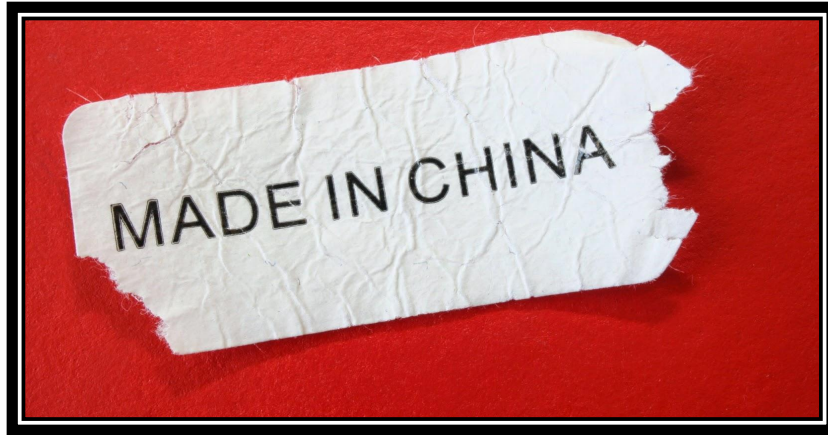
CHINA IS A WORLD FACTORY