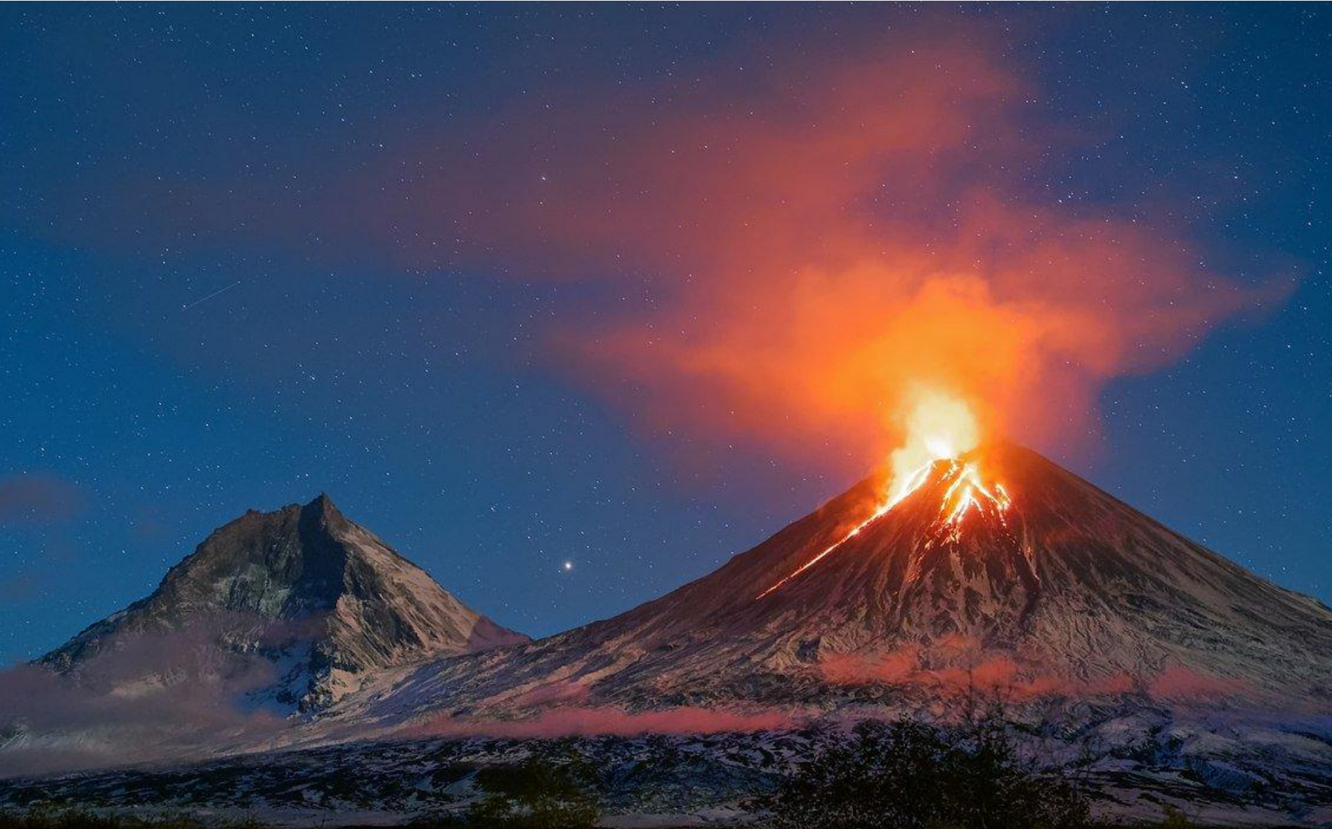
Eruption of the Klychevskaya Sopka