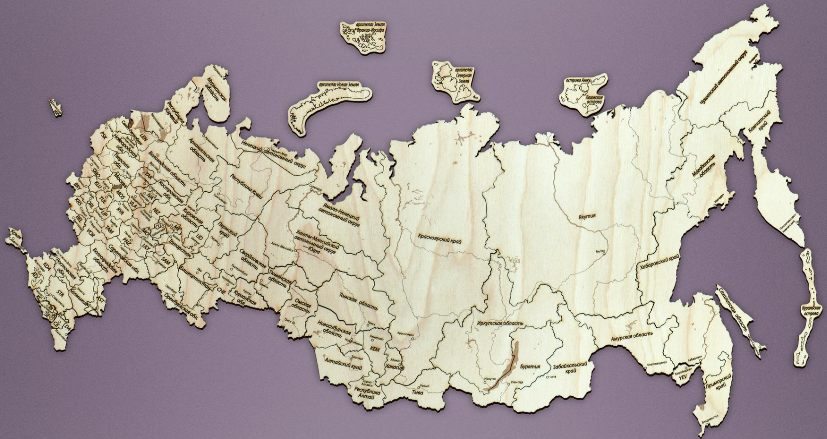
Russian map with republics