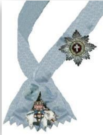
Danish Elephants order