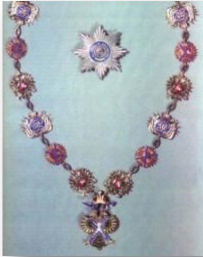
St Andrey Pervozvanny order