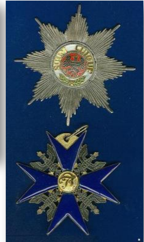
Prussian Black Eagle order

and superior titles, ranks: Prince of Rome and Russia, the Duke of Izhora, the Field Marshal