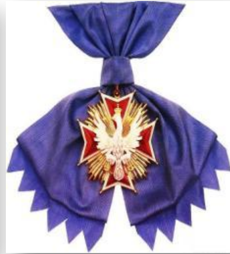
Polish White Eagle order