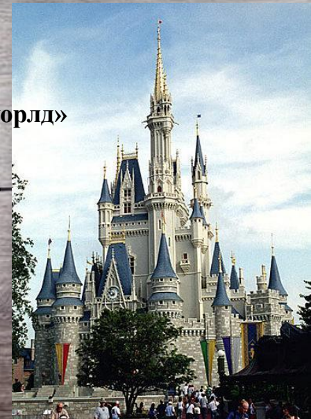
Флорида. Орландо. «Диснейворлд» . Замок Золушки.

Unforgettable is visiting the Disney parks in Miami-Orlando, where adults and children can visit different countries and magical kingdoms, talk with cartoon characters and fairy tales, visit various attractions - in a word, get a lot of fun.