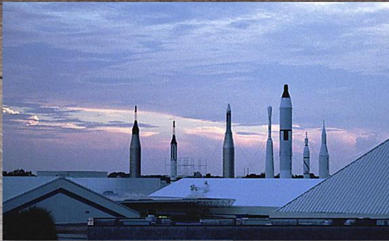
Флорида. Мыс Канаверал. Космический центр Джона Ф. Кеннеди. Сад Ракет.