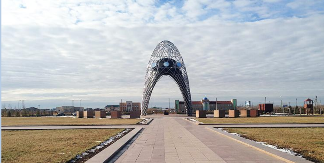
Museum and memorial complex “Algeria”