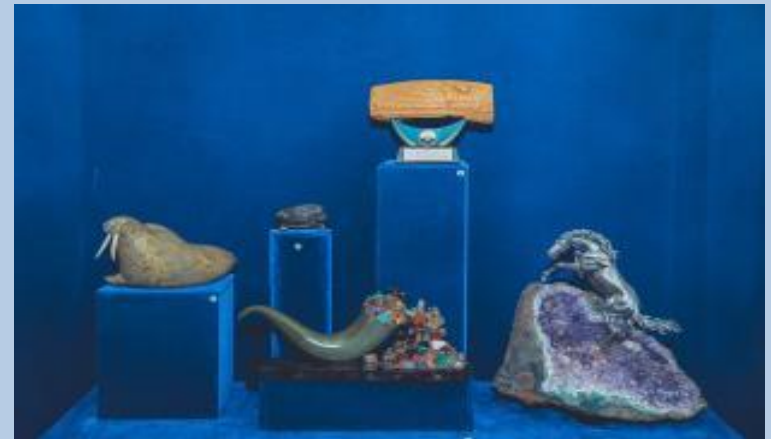
Exposition " Gifts To The First President Of The Republic Of Kazakhstan"