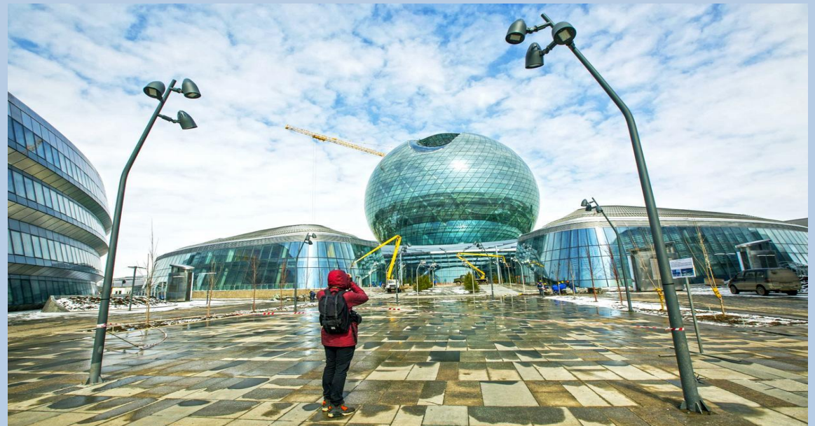
The national pavilion “Nur Alem”