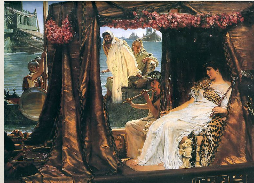
Painting of Cleopatra