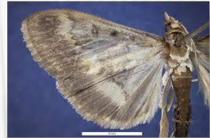
Female, ventral view