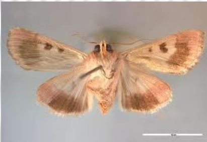
Male, dorsal view