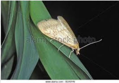
Female, dorsal view