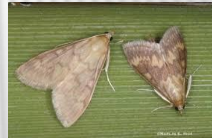
Male, ventral view