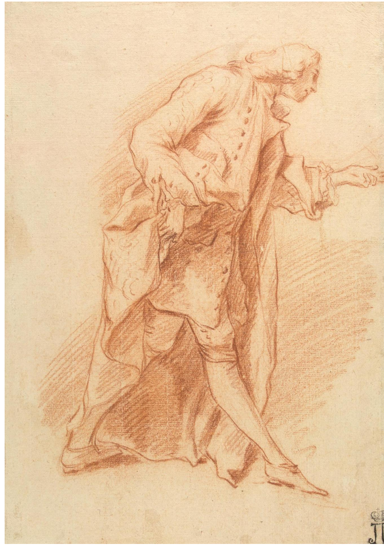
Lancret, Nicolas: Male Figure (First third of the 18th century).