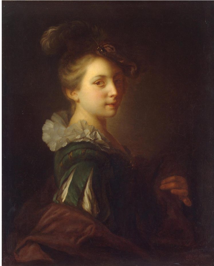
Grimou, Alexis: Young Woman in the Atrical Costume (1730s)