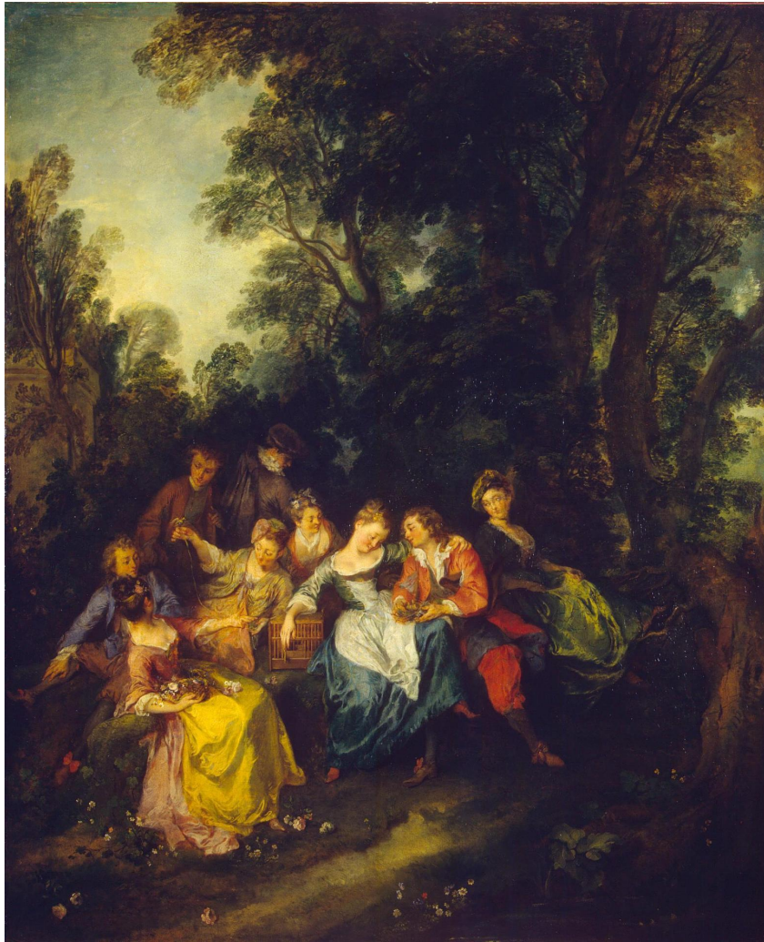
Lancret, Nicolas: Spring (1730)