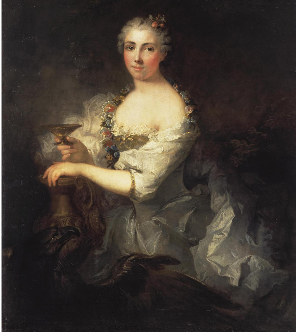
Tournieres (Levrac-Tourniers; Tourniers de Levrac), Robert: Portrait of Unknown Woman as Hebe (Between 1667 and 1752)