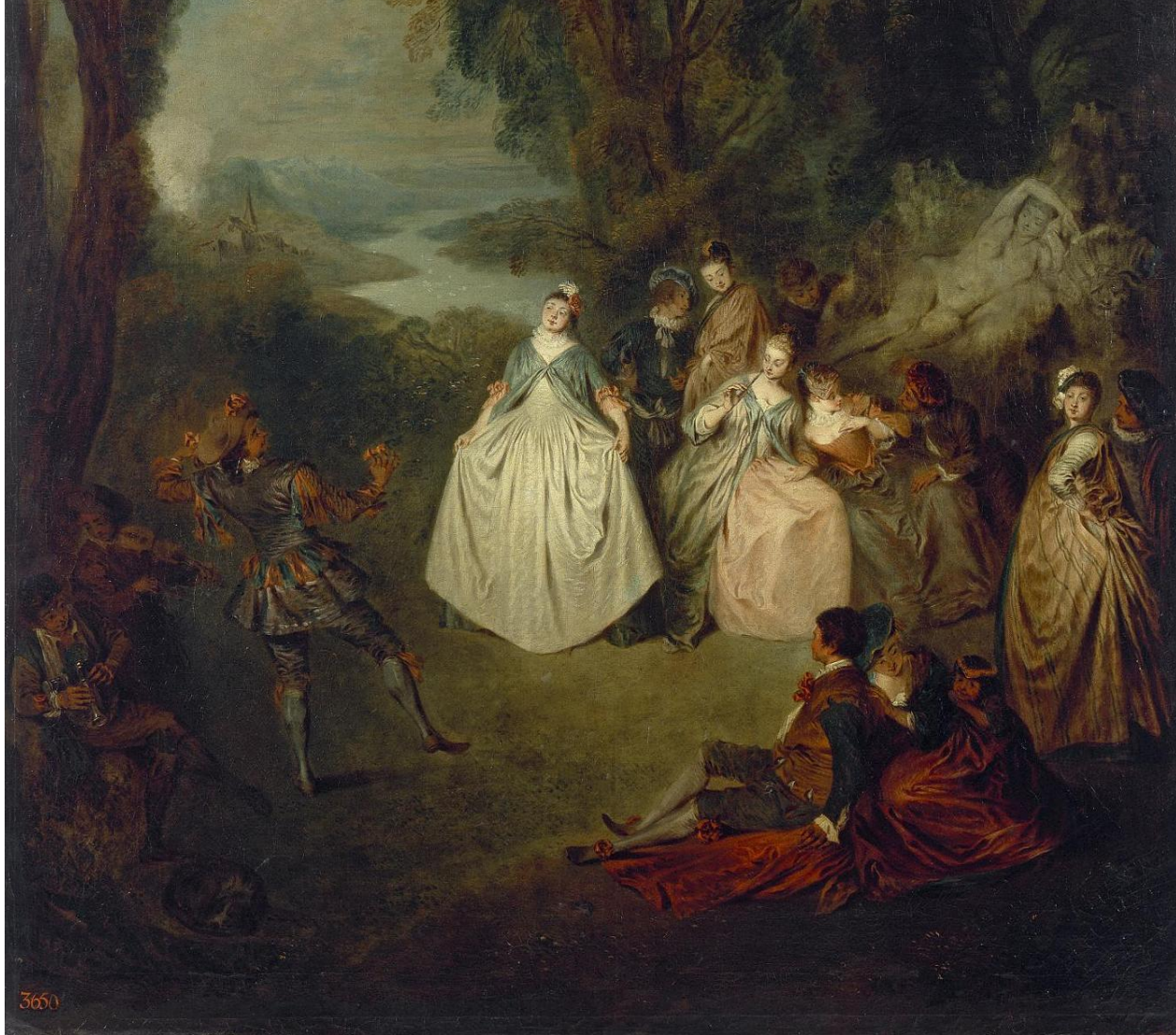
Pater, Jean-Baptiste: Dance under the Trees (Late 1720s - first half of the 1730s)