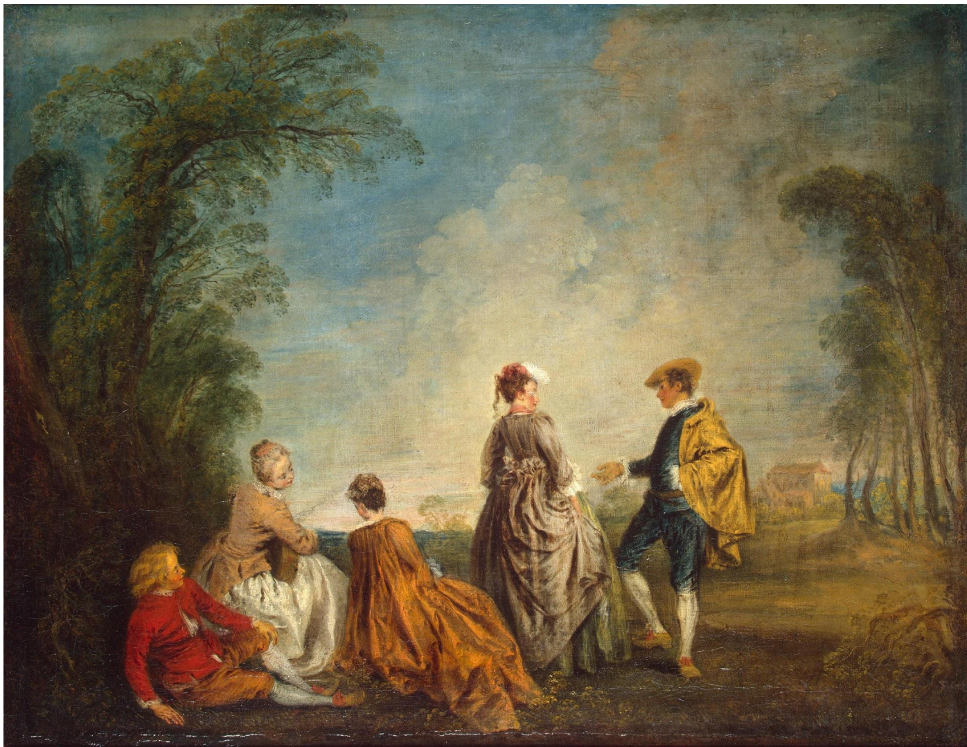
Jean-Antoine Watteau: La proposition embarrassante (1715-16)