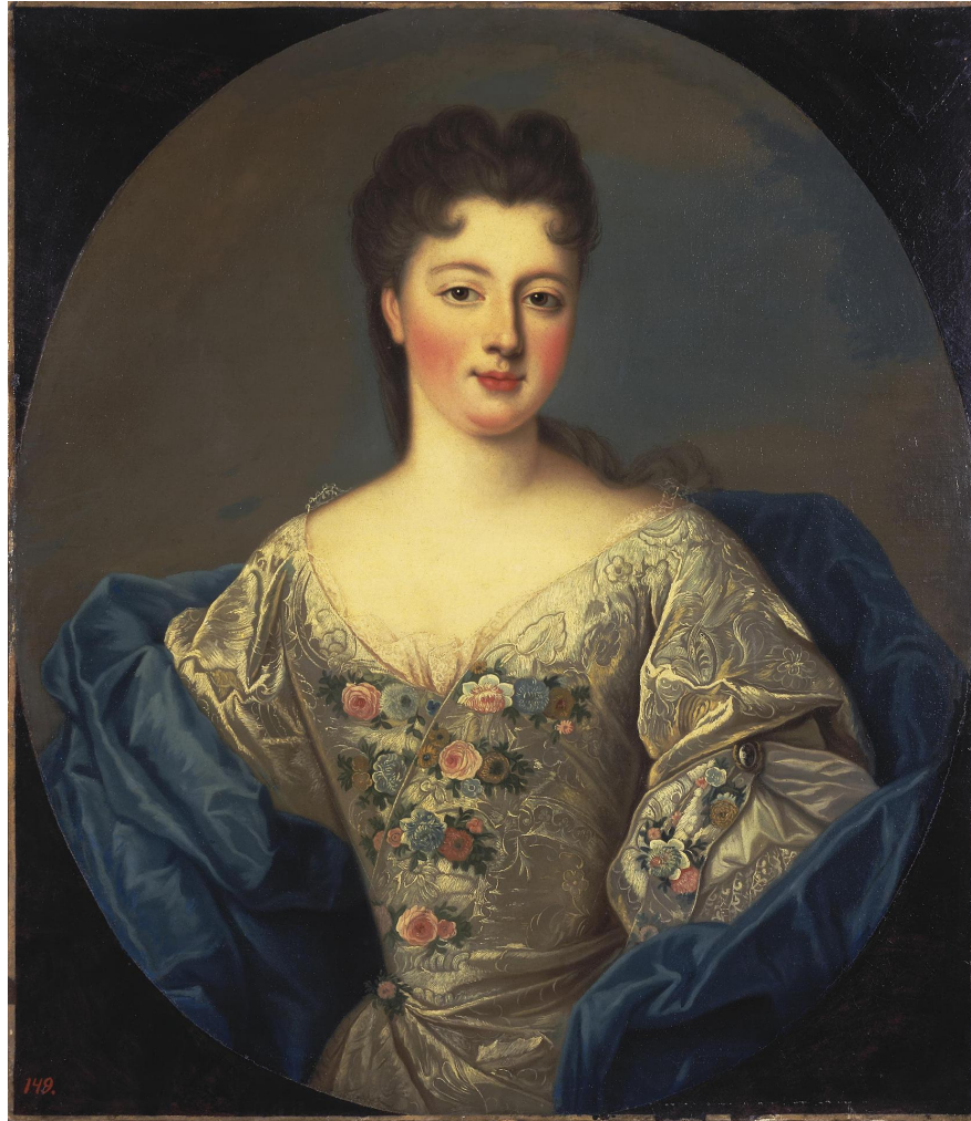
Gobert, Pierre: Portrait of Luiza Adelaida of Orlean (unknown, 1662-1744)