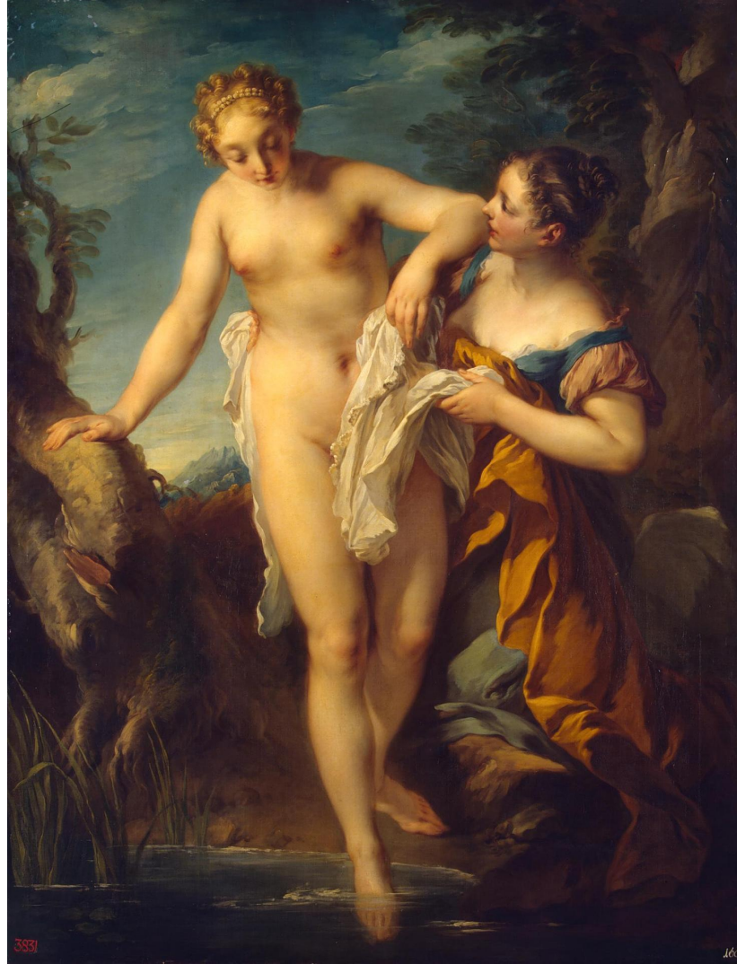
Lemoyne, Francios: Woman Bathing (After 1724)