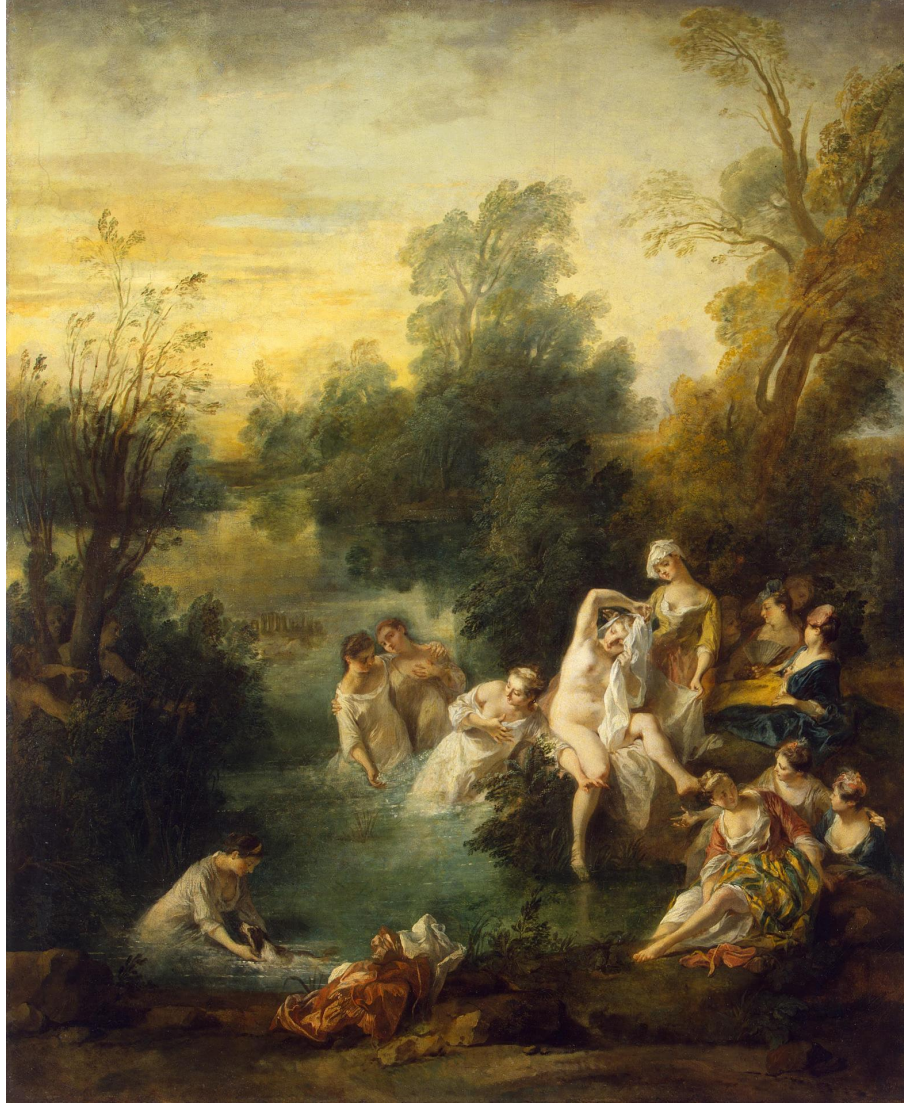
Lancret, Nicolas: Summer (ca.1730)