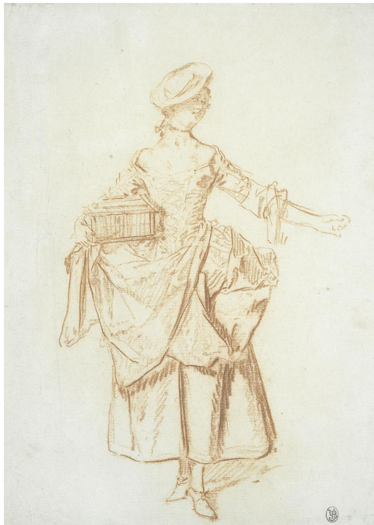
Lancret, Nicolas: Young Girl with a Bird Cage (First half of 18th century)