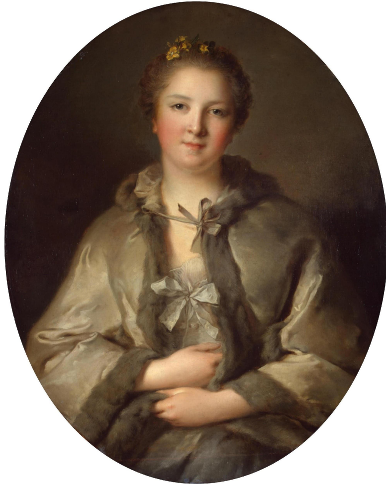
Nattier, Jean Marc: Portrait of a Woman in Grey (Louise Adelaide of Orleans?) (Early 18th century)