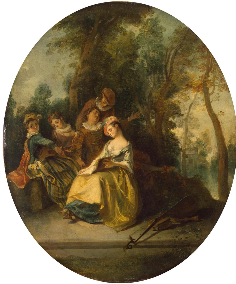
Lancret, Nicolas: Concert in the Park (ca 1738)