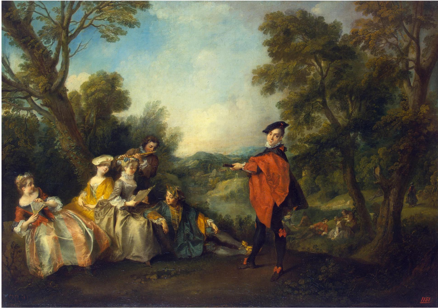
Lancret, Nicolas: Concert in the Park (Between 1720 and 1743)