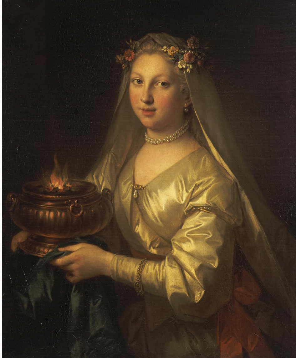
Raoux, Jean: Vestal Virgin (Between 1677 and 1730)