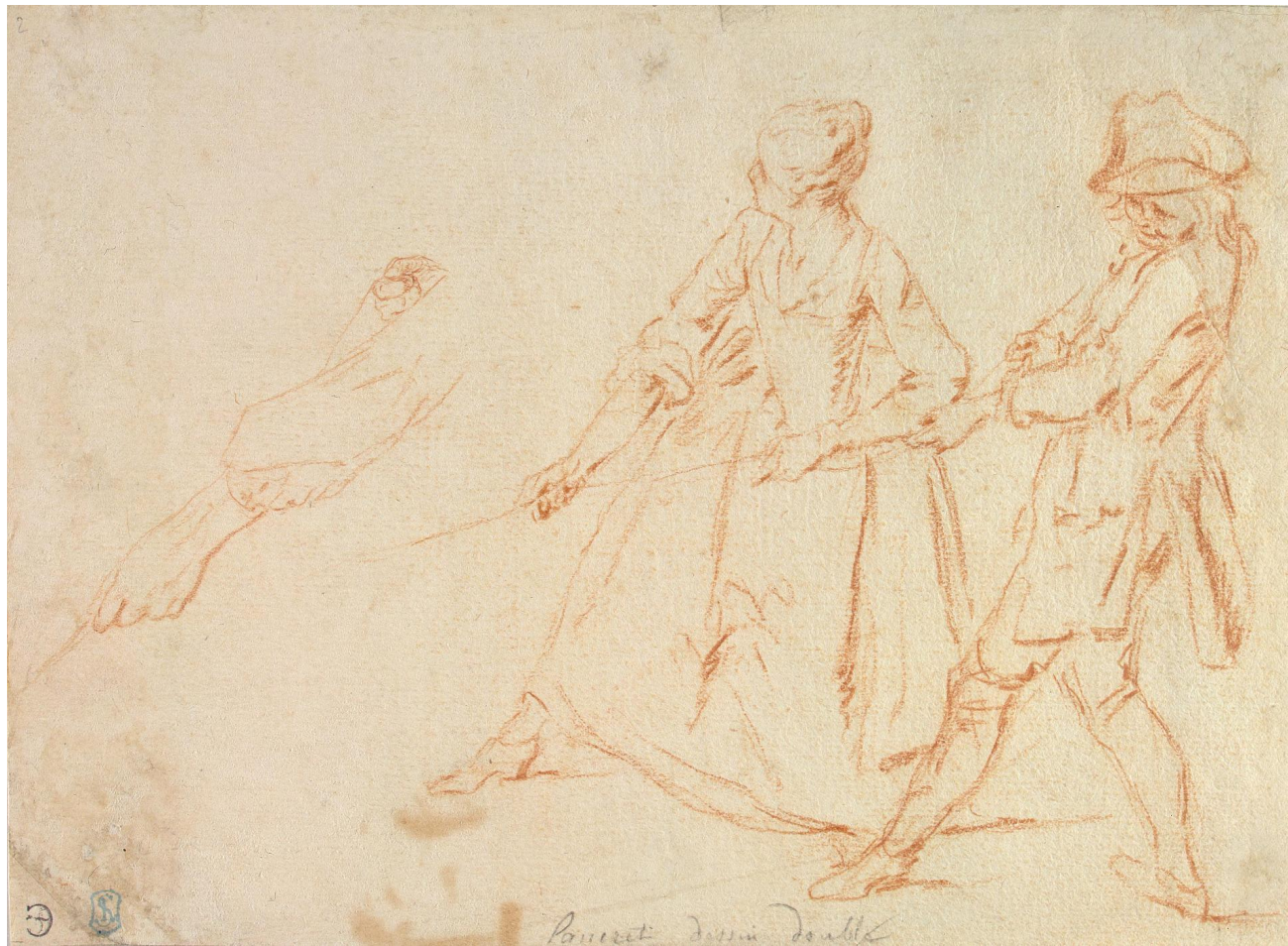
Lancret, Nicolas: Study of two Children and an Arm (1735)