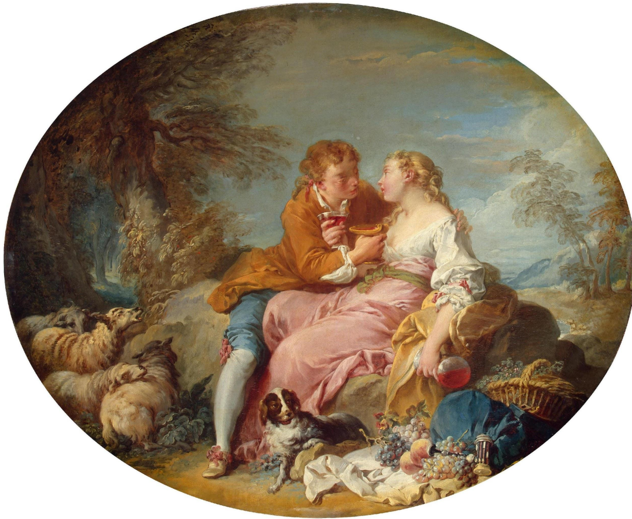
Boucher, François: Pastorale.