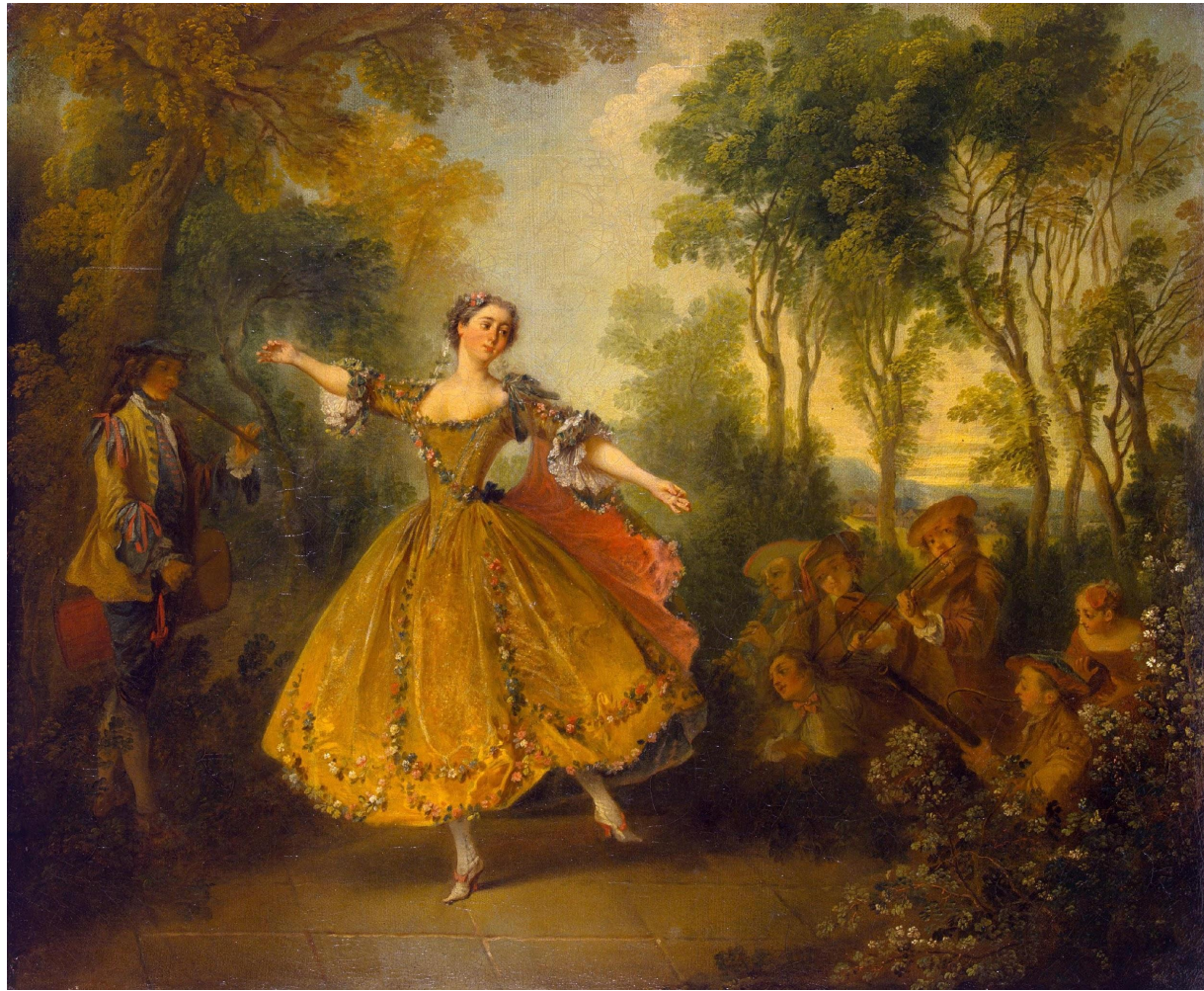
Lancret, Nicolas: Mlle Camargo Dancing (ca. 1730)