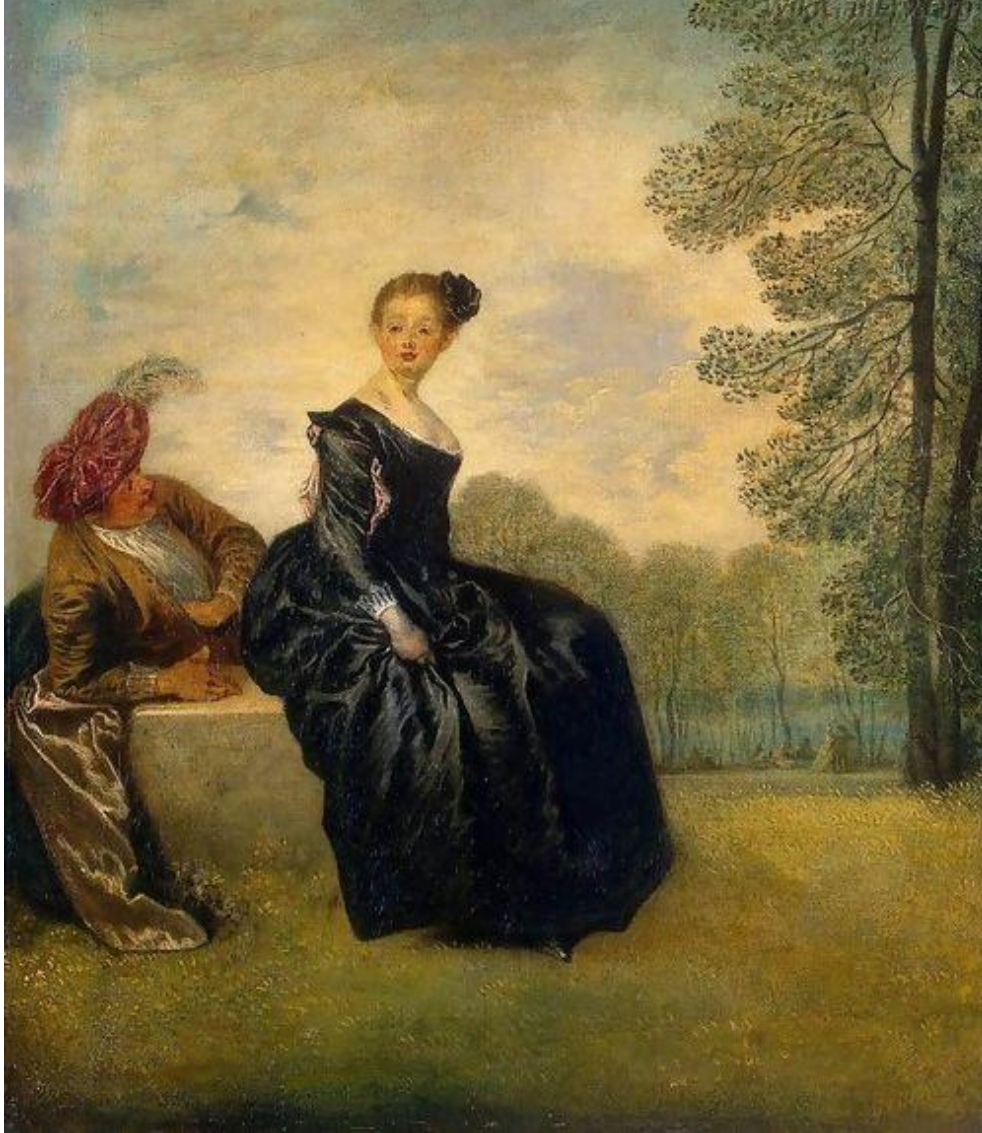
Jean-Antoine Watteau: La Badeuse. 1718.