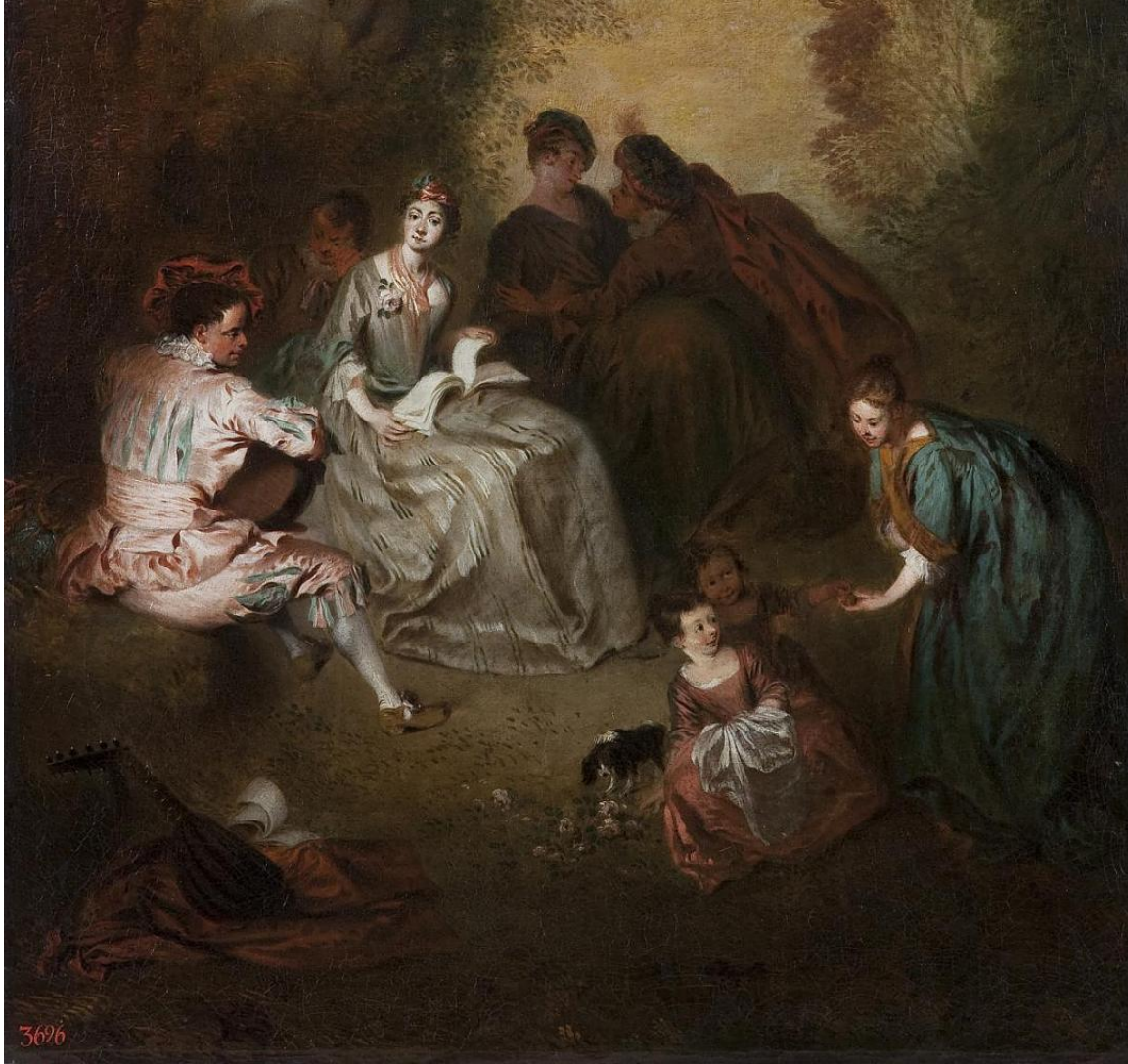
Pater, Jean-Baptiste: Musical Entertainment (part of the triptych) (Late 1720s - early 1730s)