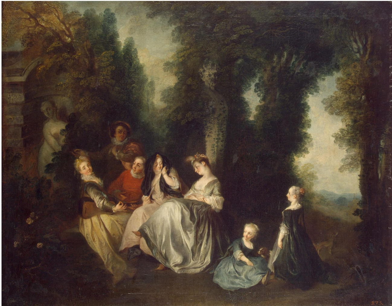
Lancret, Nicolas: Party in the Garden. (Between 1705 – 1743)