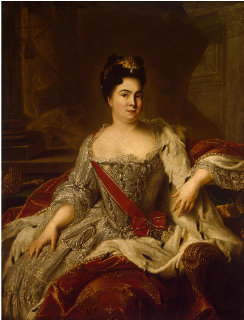
Nattier, Jean Marc: Portrait of Catherine I (1717)