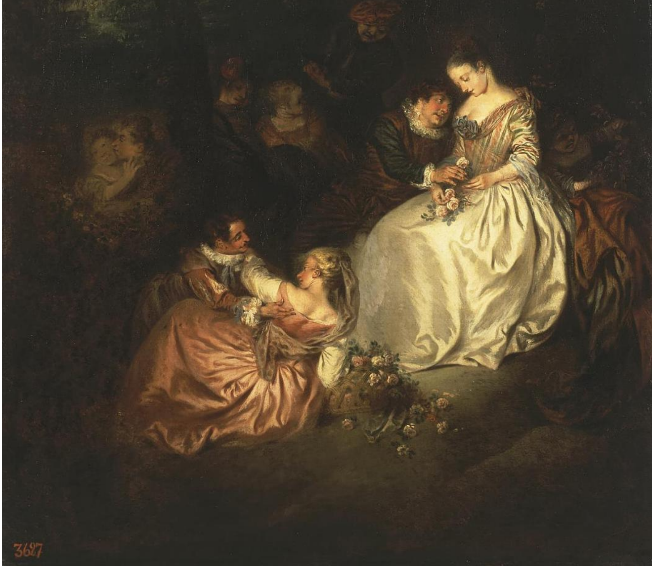
Pater, Jean-Baptiste: Scene in a Park (Late 1720s - first half of the 1730s)