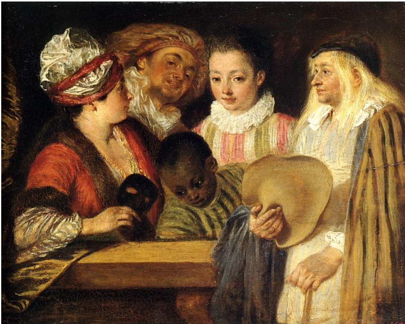
Jean-Antoine Watteau: Coquettes qui pour voir galants au rendez-vous (ca. 1718)