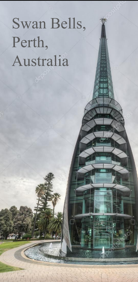
Swan Bells, Perth, Australia