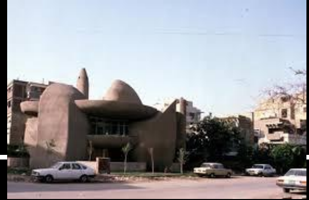
Example: Planet Africa Restaurant, Triumph Square, Heliopolis