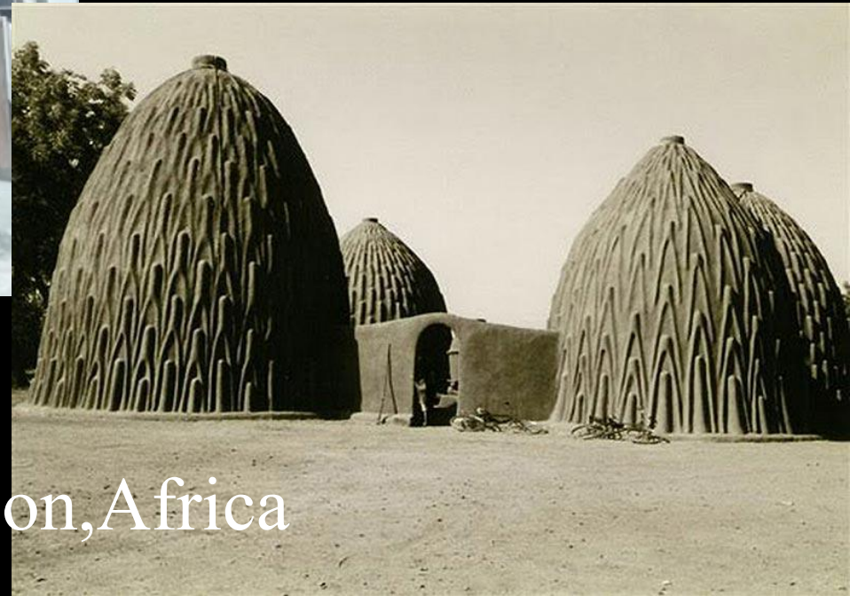
Village of Pouss, Cameroon, Africa