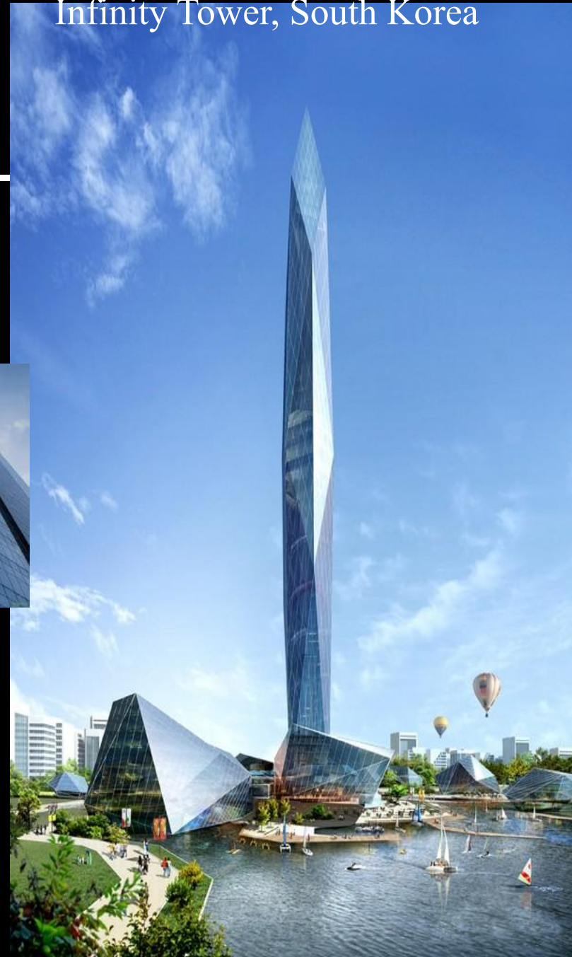
Infinity Tower, South Korea