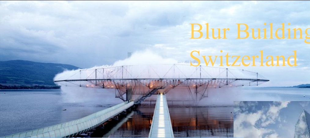
Blur Building, Switzerland