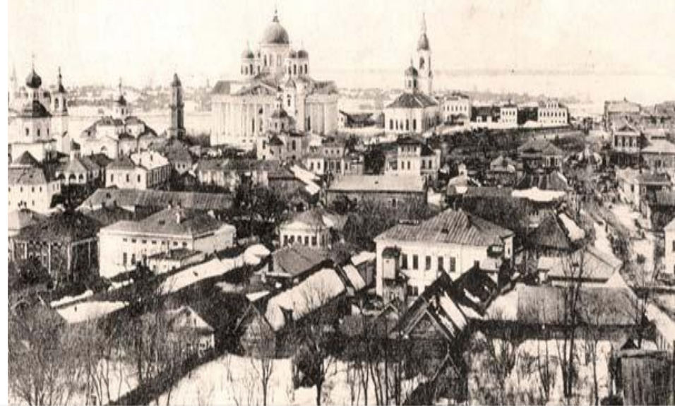
г. Арзамасъ.—Arsamas. Общій видъ.—Vue générale.