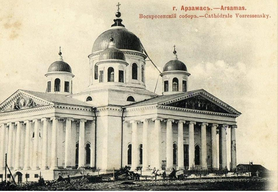
г. Арзамасъ.—Arsamas. Воскресенскій соборъ.—Cathédrale Vosressensky.