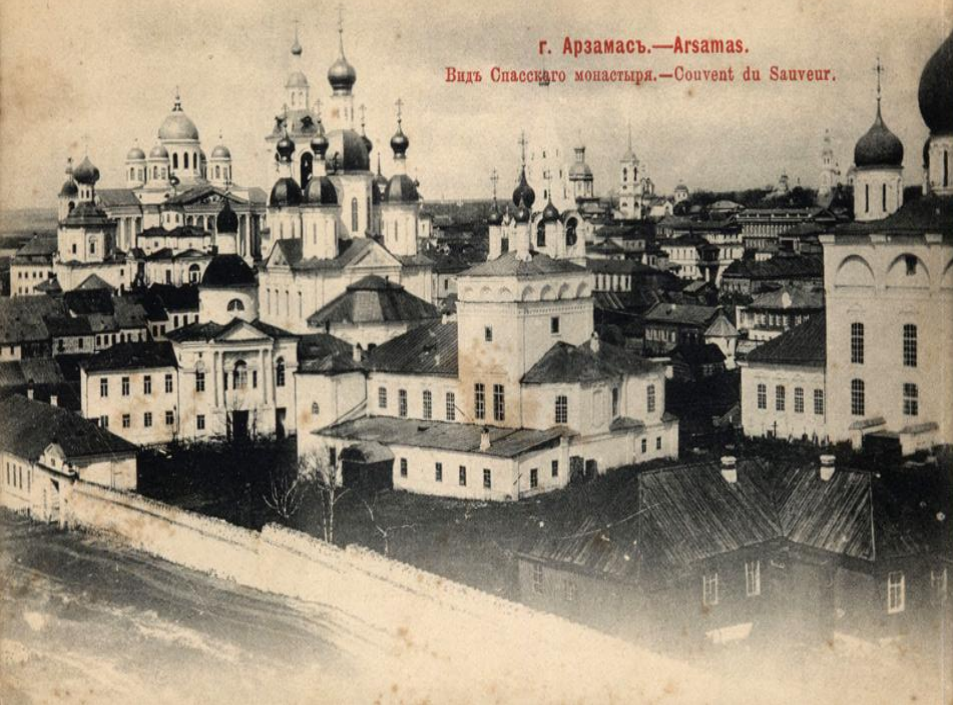
г. Арзамасъ.—Arsamas. Видъ Спаскаго монастыря.—Couvent du Sauveur.