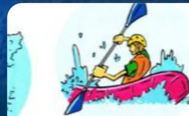
white water rafting