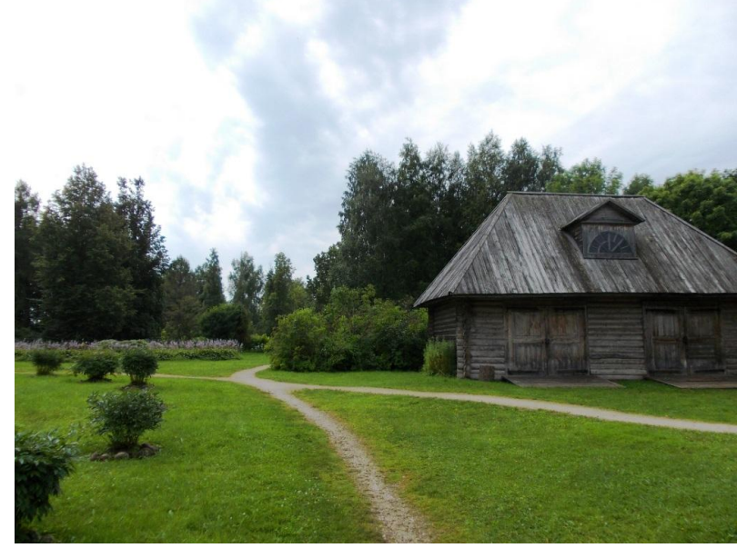
The coach house