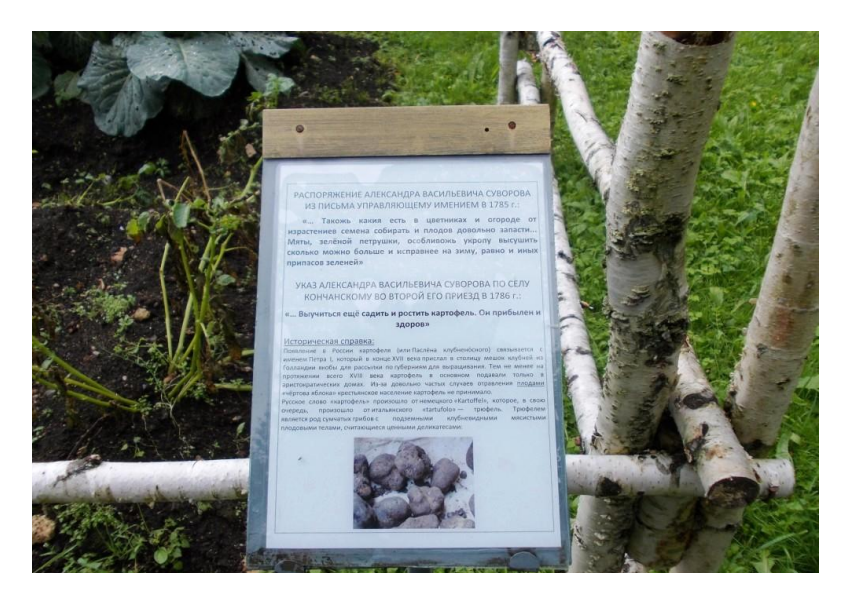
That is how potato came in Russia