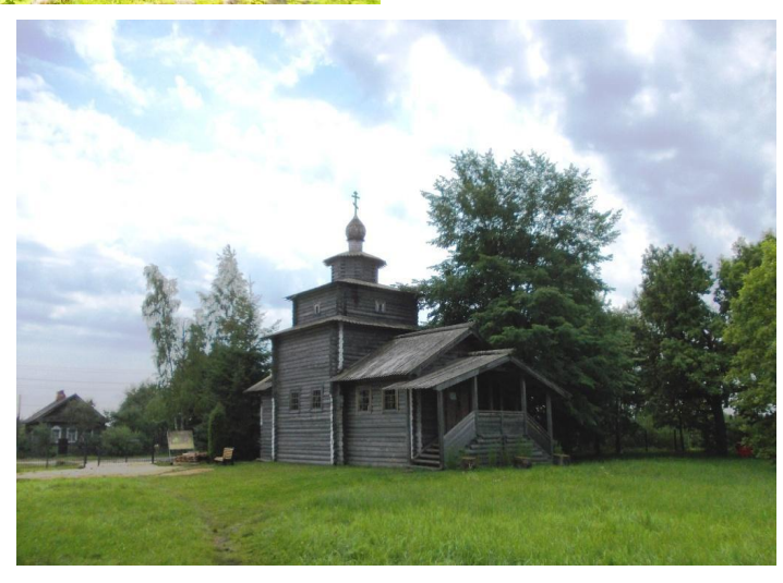
St. Alekşandr Nevskiy church in the park