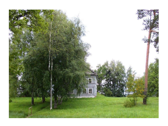
The pound in the park and the building of the former primary school