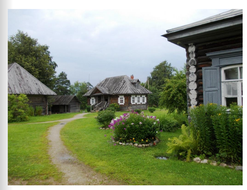
The kitchen outbuilding