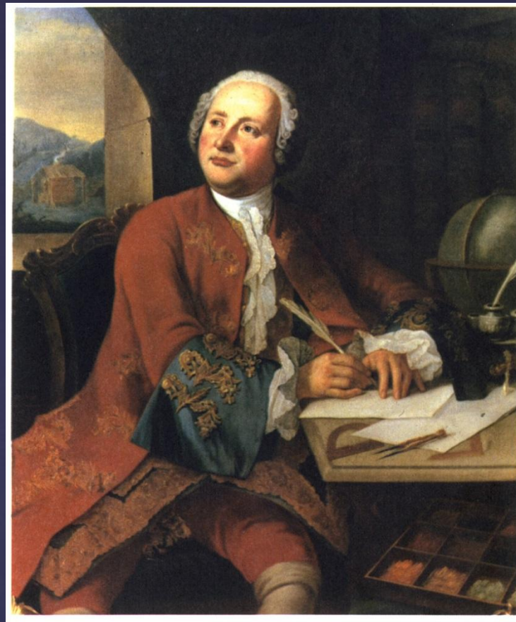
Mikhail Lomonosov 19.11.1711 – 15.04.1765