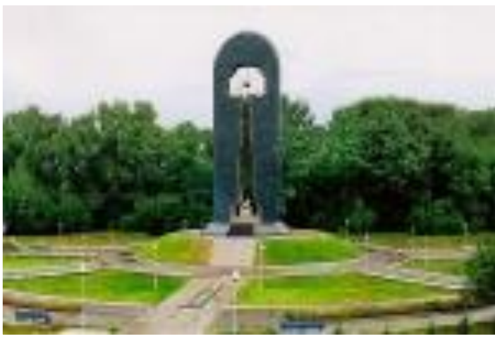
Monument "Stronger than death"