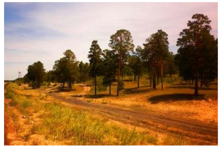
State Forest Nature Reserve "Semey`s forest"