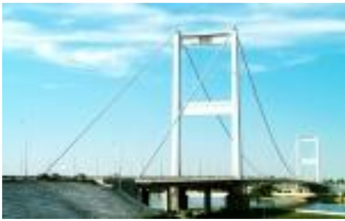
the bridge through Irtysh river