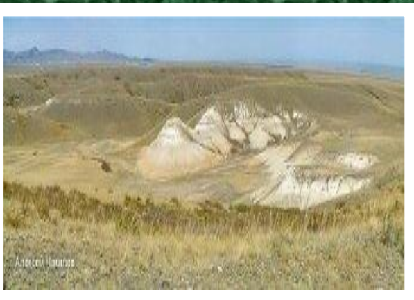
Tarbagatai State Nature Reserve