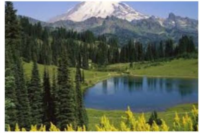
Katon-Karagay State National Natural Park