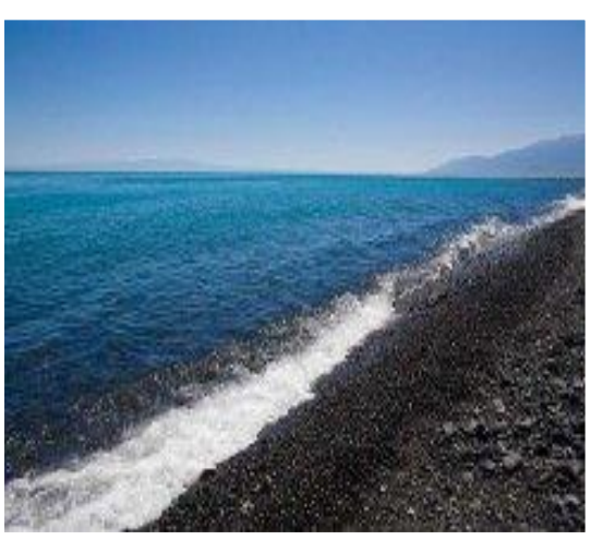
Alakol State Nature Reserve