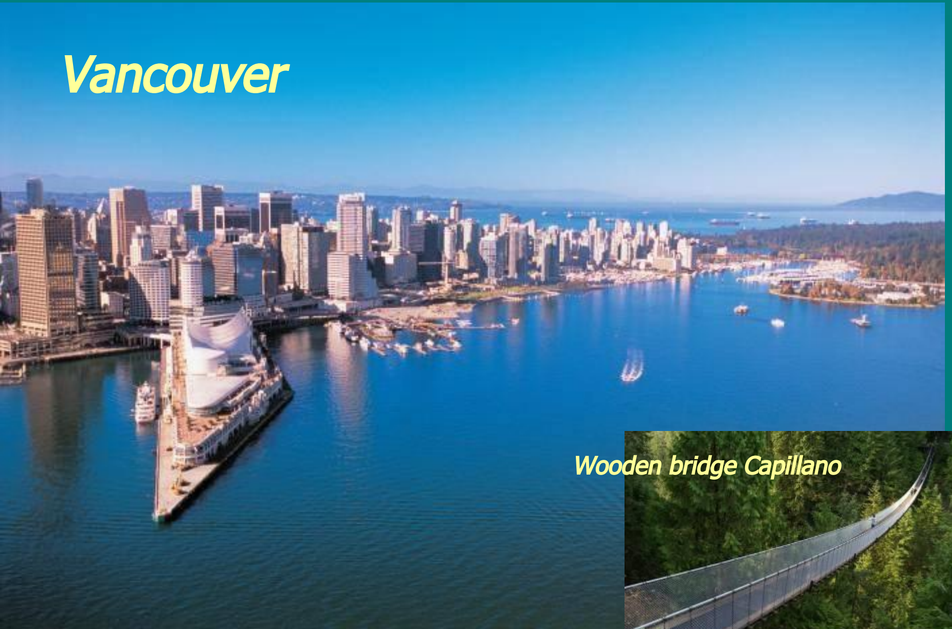
Wooden bridge Capillano