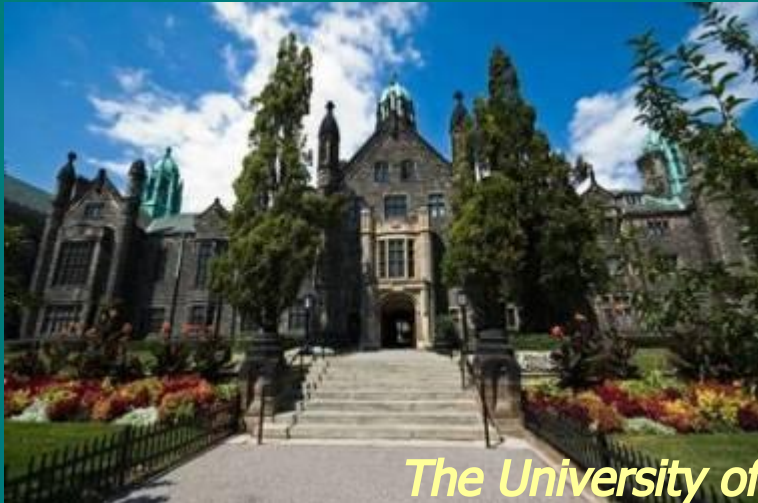
The University of Toronto