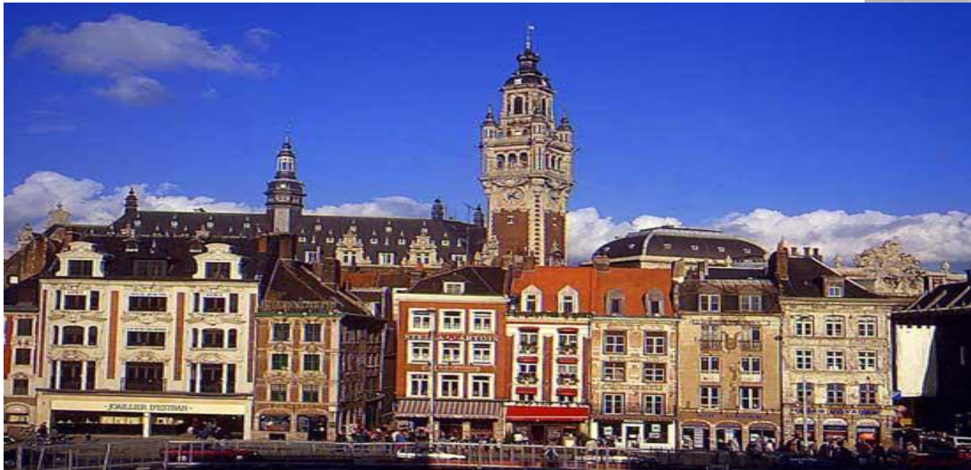
Lille. Place Charles de Gaulle