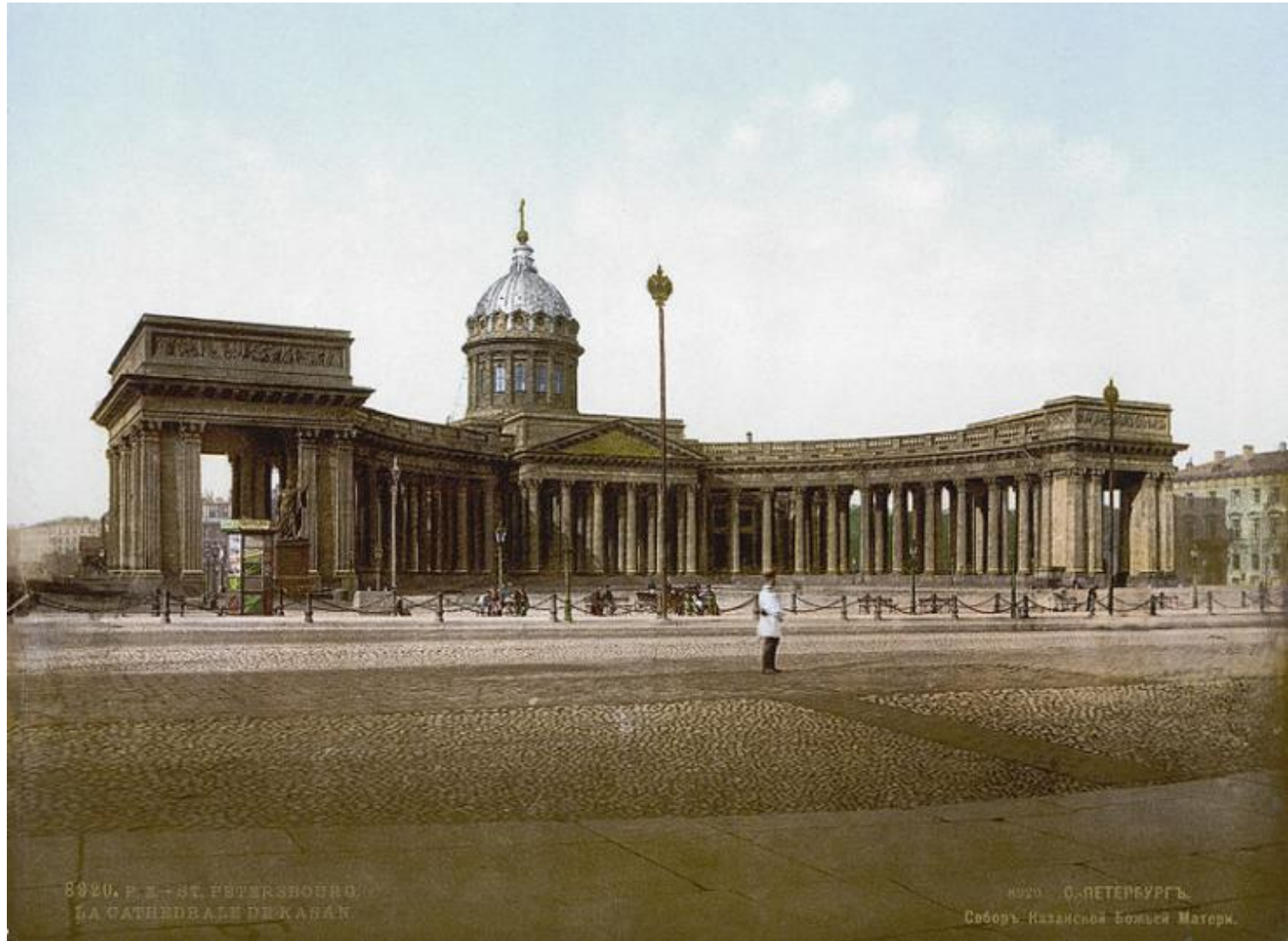
1820. Р. И. - СТ. ПЕТЕРБУРГ. КА САНДРАЛЕ ДЕКАВАН.

The Kazan Cathedral became the tallest temple at the time (it has reached the height of 71.5 m) and one of the largest religious buildings in St. Petersburg.