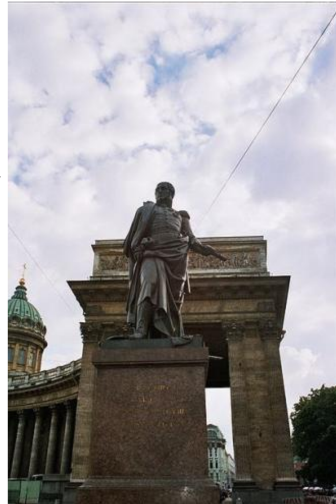
Field Marshal M. I. Kutuzov

Monuments memorial stressed the importance of the Kazan Cathedral as a kind of monument to the immortal feats performed by Russian soldiers in the name of the Fatherland.