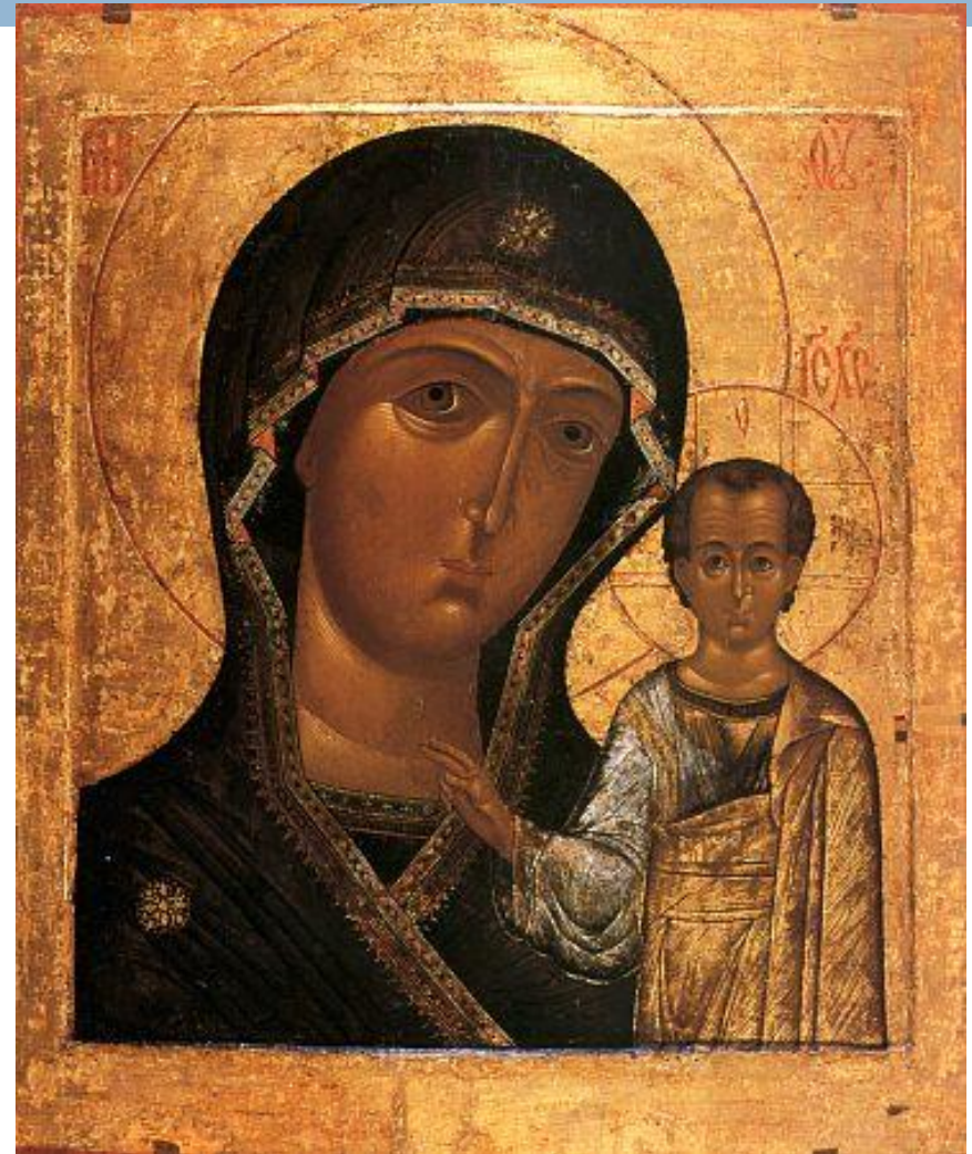
The Kazan icon of the Mother of God