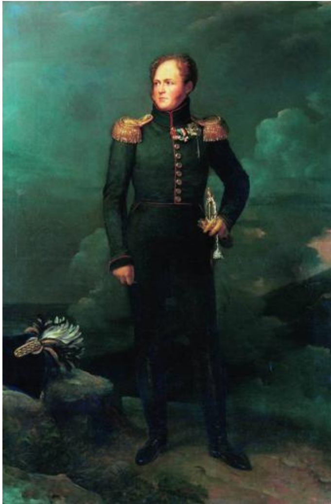
The Emperor Alexander I

September 8, 1801, took place the solemn ceremony of the Kazan Cathedral, which was attended by Emperor Alexander I.