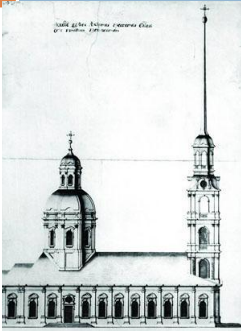
The Church Of Nativity

Previously on the site of the Cathedral was a small stone Church of the Nativity of the blessed virgin, where in 1737 was moved venerated image of our lady of Kazan. It was the first Orthodox Church on the Nevsky Prospekt.