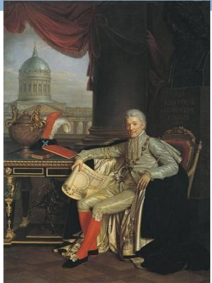
Alexander Sergeievich Stroganov, the Chairman of the Board of Trustees during the construction of the Cathedral