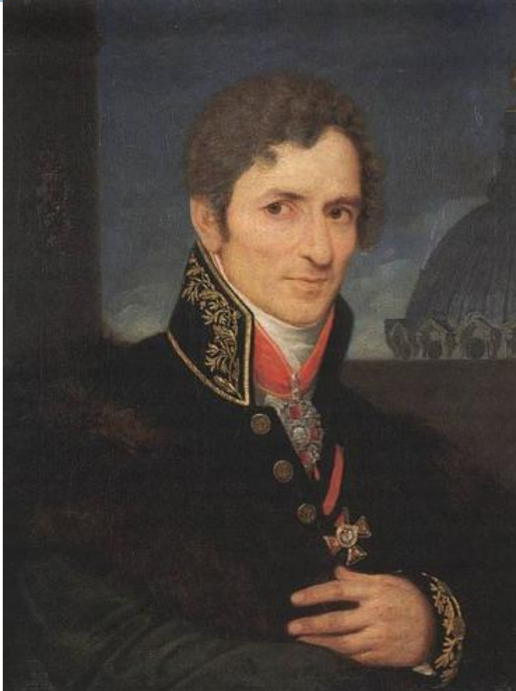
Andrey Nikiforovich Voronikhin, architect

By the late 18th century, the Church building became dilapidated and no longer fit established by the time of the appearance of the main Nevsky Prospekt. And in November, 1800, by results of competition of projects of a new Cathedral, a project was approved, executed by the architect A. N. Voronikhin.