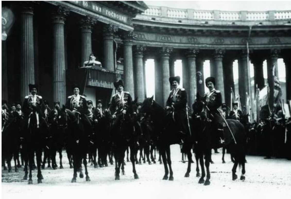
The officers of the life guards regiment of His Majesty