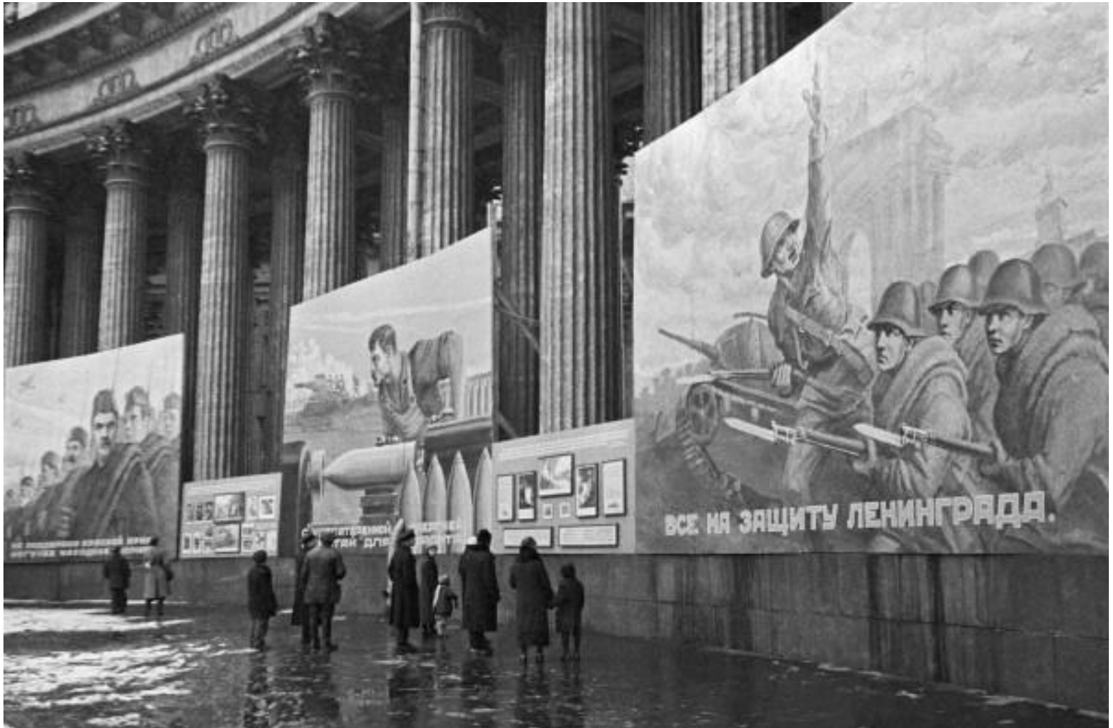
Posters at the Council in October 1941

In 1932 there was opened the Museum of the history of religion. During the siege of Leningrad, the Cathedral was significantly damaged by bombings, but after the war was a major overhaul of the building.