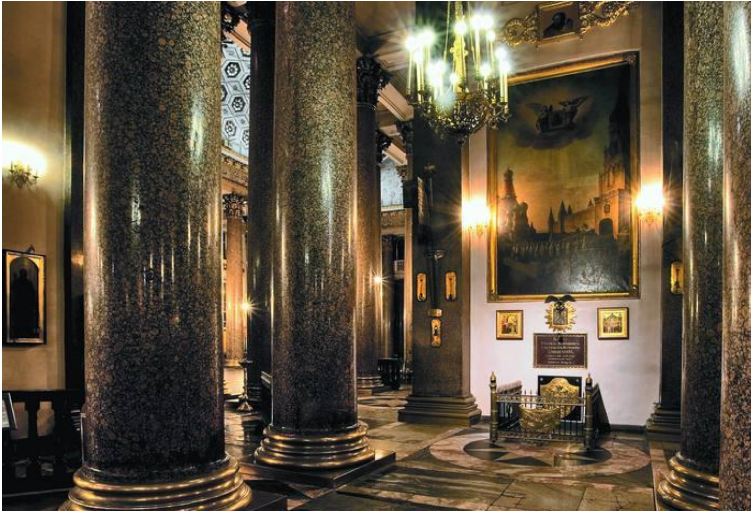
The tomb of field Marshal M. I. Kutuzov

In 1813, the Cathedral was buried field Marshal Mikhail Kutuzov.