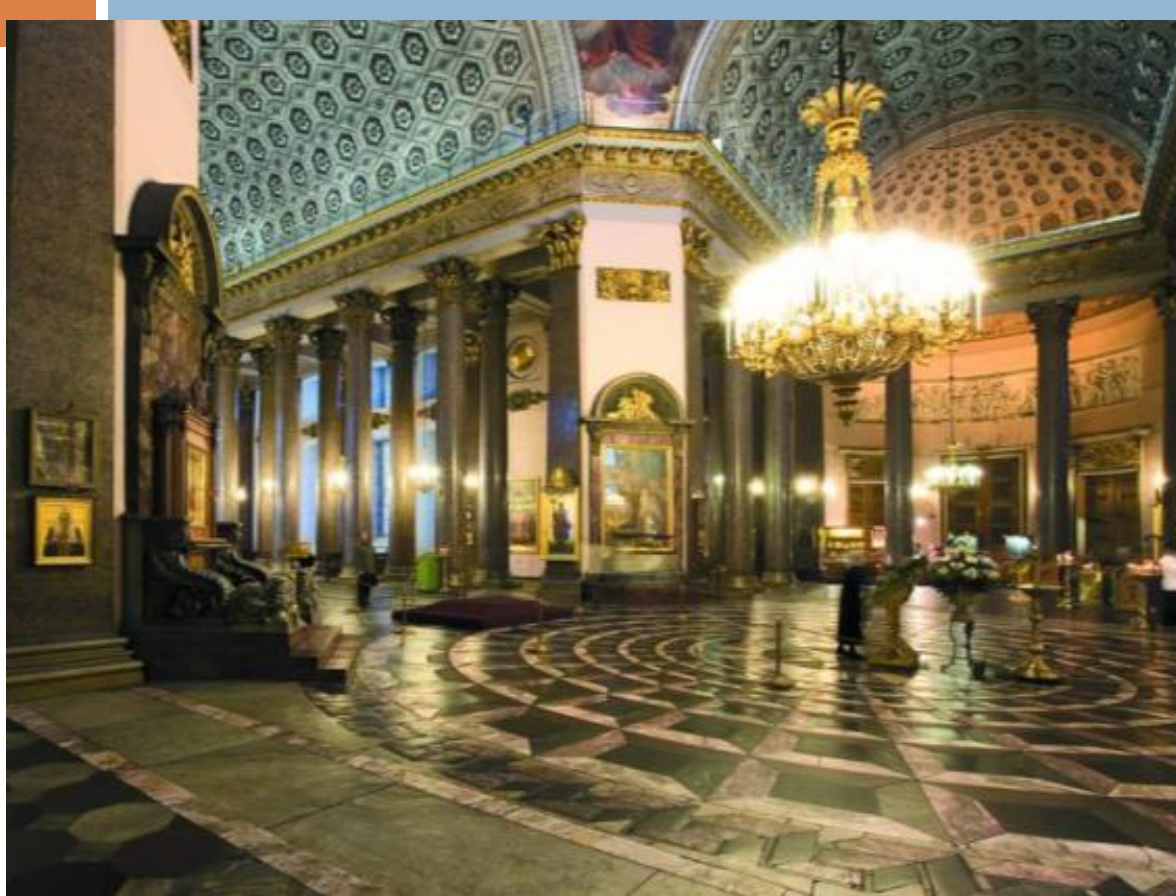
Interior of the Kazan Cathedral. The Central part.

The construction of the Cathedral lasted 10 years, the decoration of the temple was used mainly domestic materials: marble Olonetsky, Vyborg and Serdobol granite, Riga and Pudozh limestone. For the first time in the global construction practice, Voronikhin was applied to the metal structure of the dome.