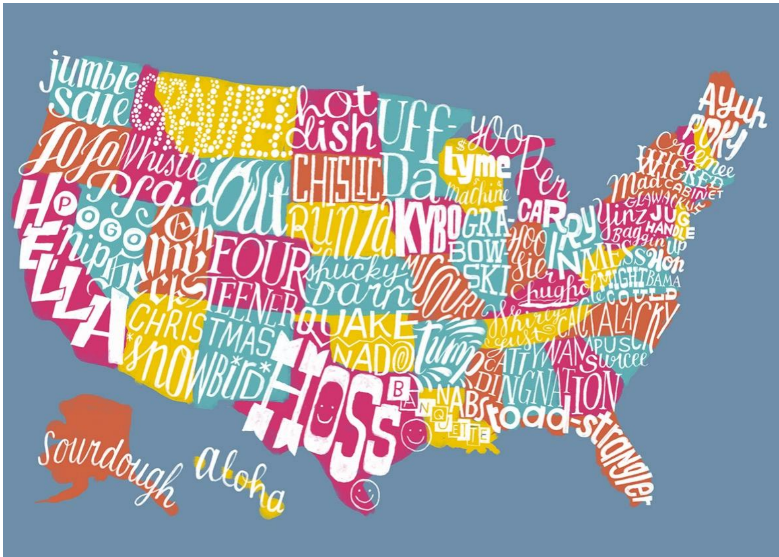
American student slang