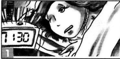
every day / get up / at half past seven

Look at the pictures of Helen and use the prompts to write sentences. Use the correct form of the present simple.