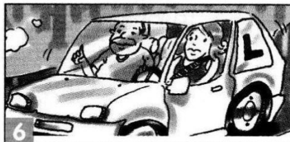
have a driving lesson / twice a week

1 Every day, Helen gets up at half past seven.