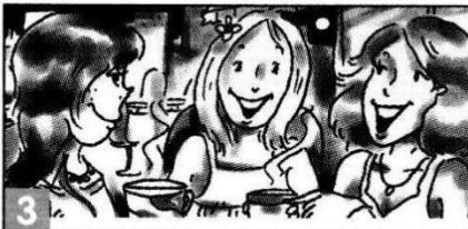
in the evening / usually / meet her friends for coffee