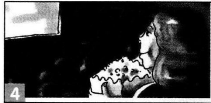
once a week / watch a film at the cinema