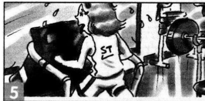
rarely / go to the gym