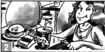
often / eat fast food for lunch