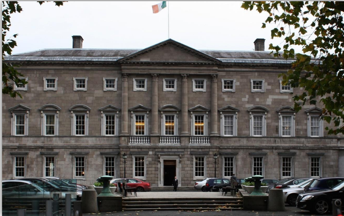
Leinster House, Dublin (Meeting place)

The Republic of Ireland is a parliamentary democracy based on the Westminster model with a written constitution and a popularly elected president who has mostly ceremonial powers.