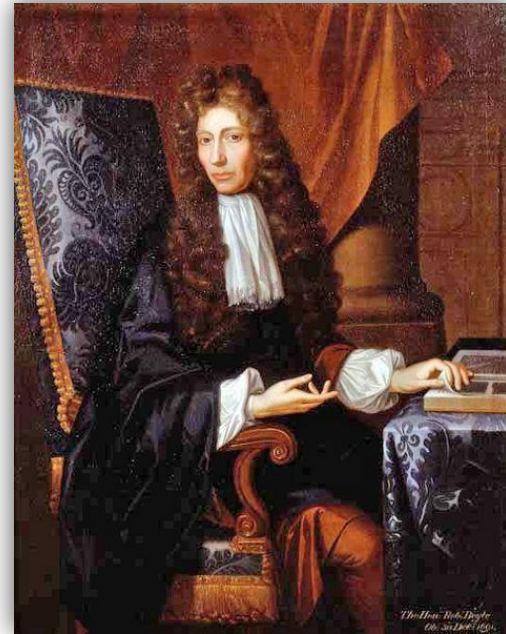
Robert Boyle formulated Boyle's Law