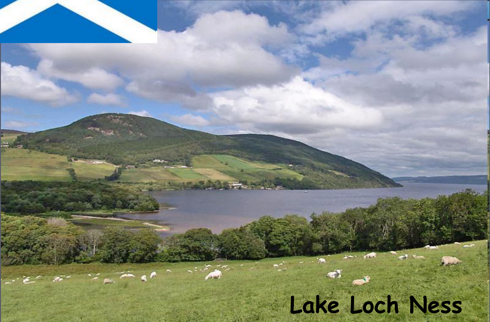
Lake Loch Ness

The cross of St. Andrew is the patron saint of Scotland.