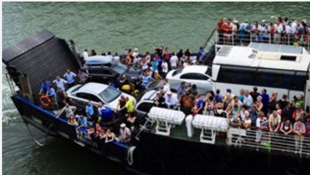
go by ferry