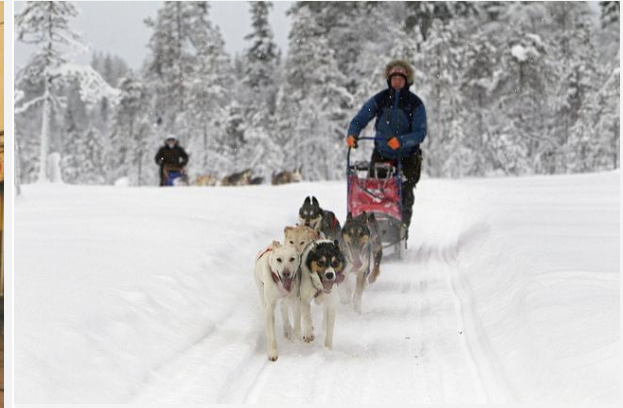
riding a dogsled