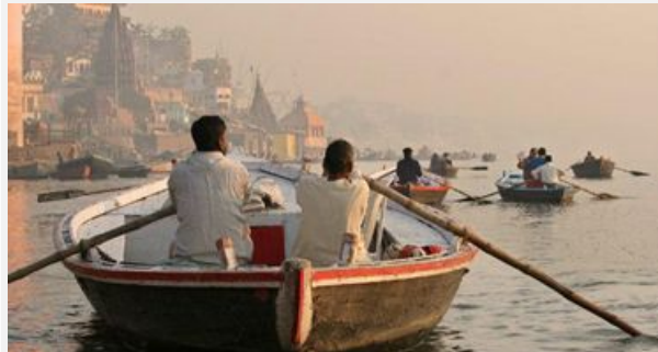
go by boat