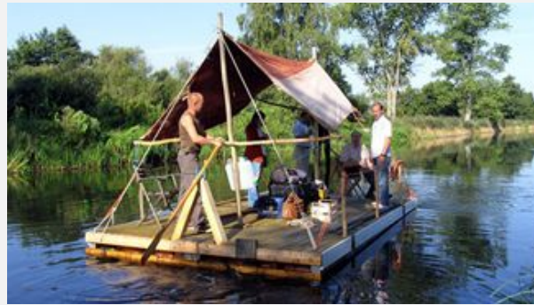
go rafting / travel by raft / float on a raft