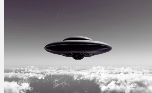
by UFO (Unidentified Flying Object)