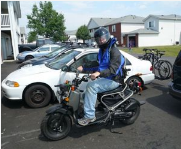
by scooter / moped / motorbike