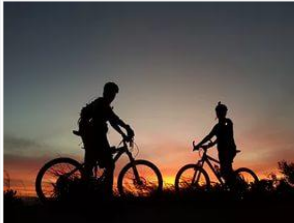
by bicycle / bike