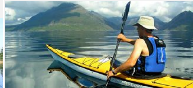
go kayaking / canoeing [kə'nu:]