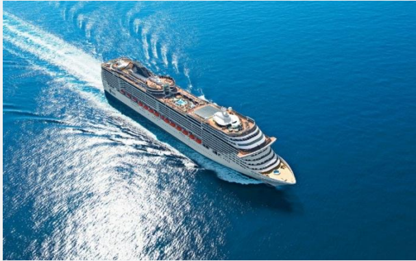
go by cruise liner