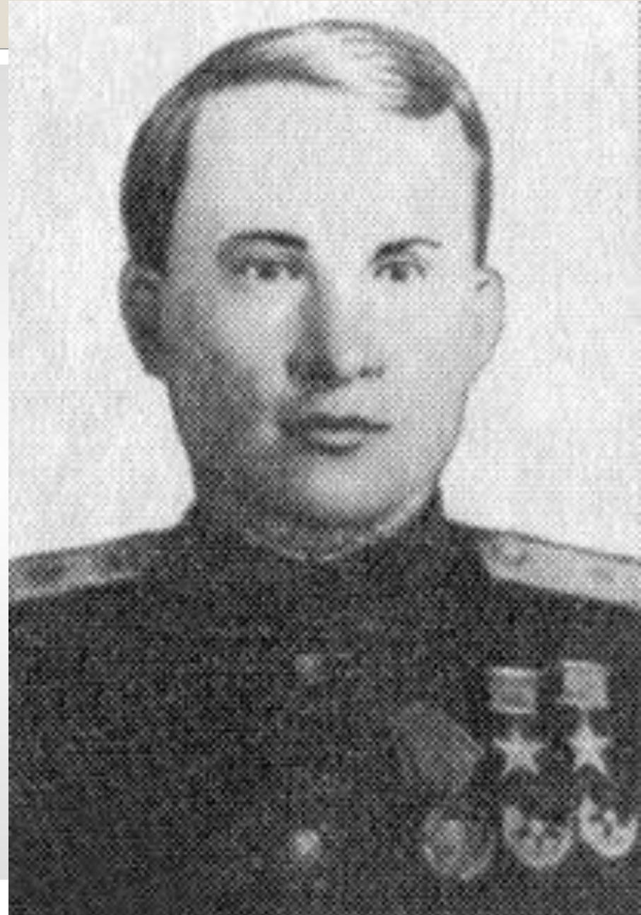
S. Lugansk. Pilot. Personally shot down 37 enemy aircraft