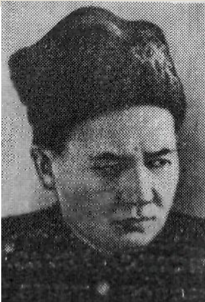
B.Momyshev. Hero of the Soviet Union, the writer