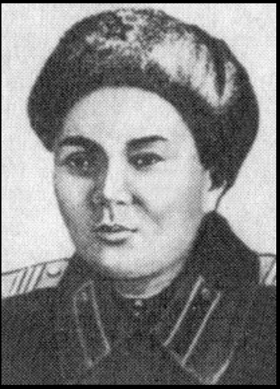
Manshuk Mametova. Pulemëchitsa, Hero of the Soviet Union.