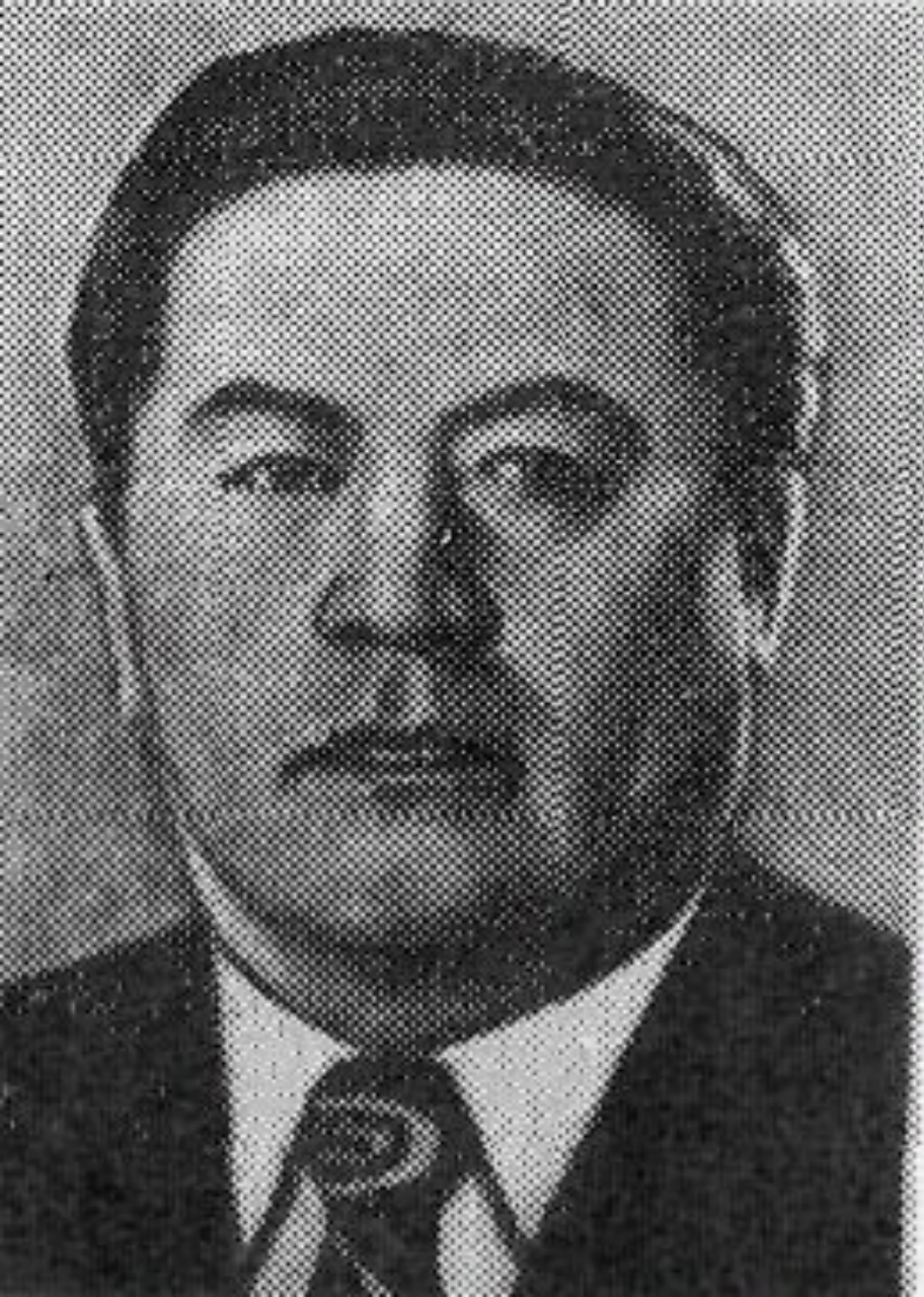
R. Koshkarbaev. He hoisted the flag over the Reichstag one of the outputs