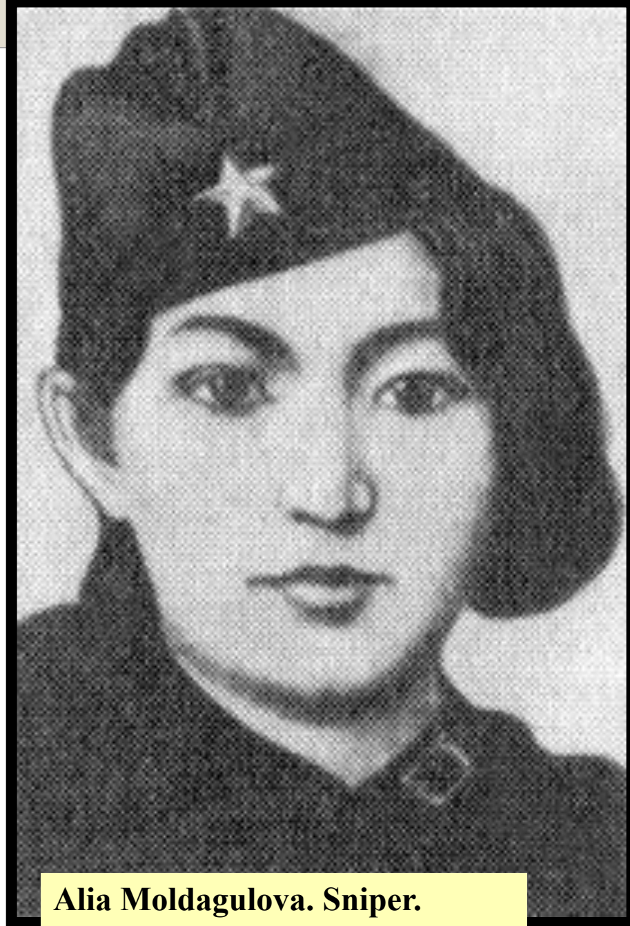
Alia Moldagulova. Sniper.