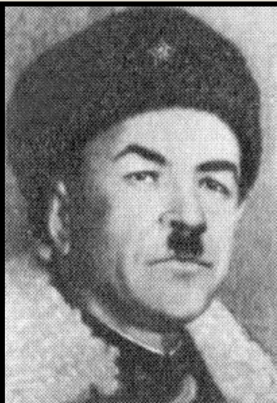
I. Panfilov. The commander of 316 Infantry Division.