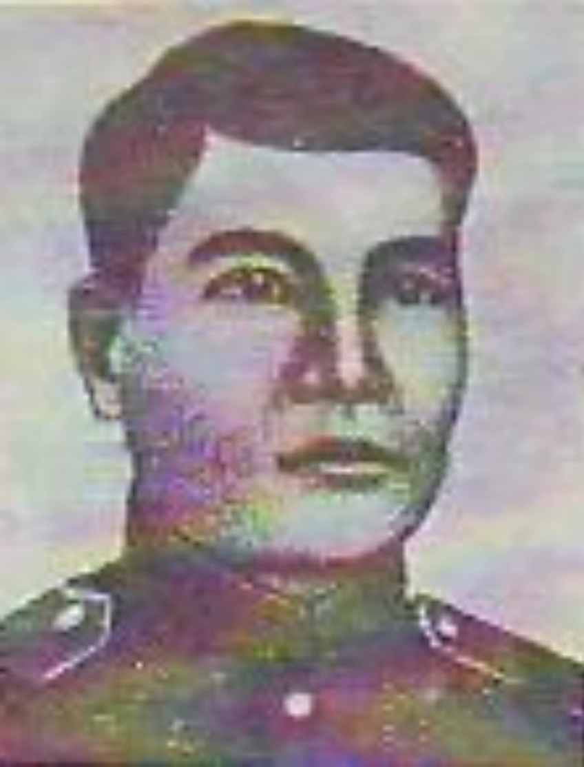
Hero of the Soviet Union. Sultan Baimagambetov, repeated the feat A. Matrosov in 1943 in the battle of Leningrad.