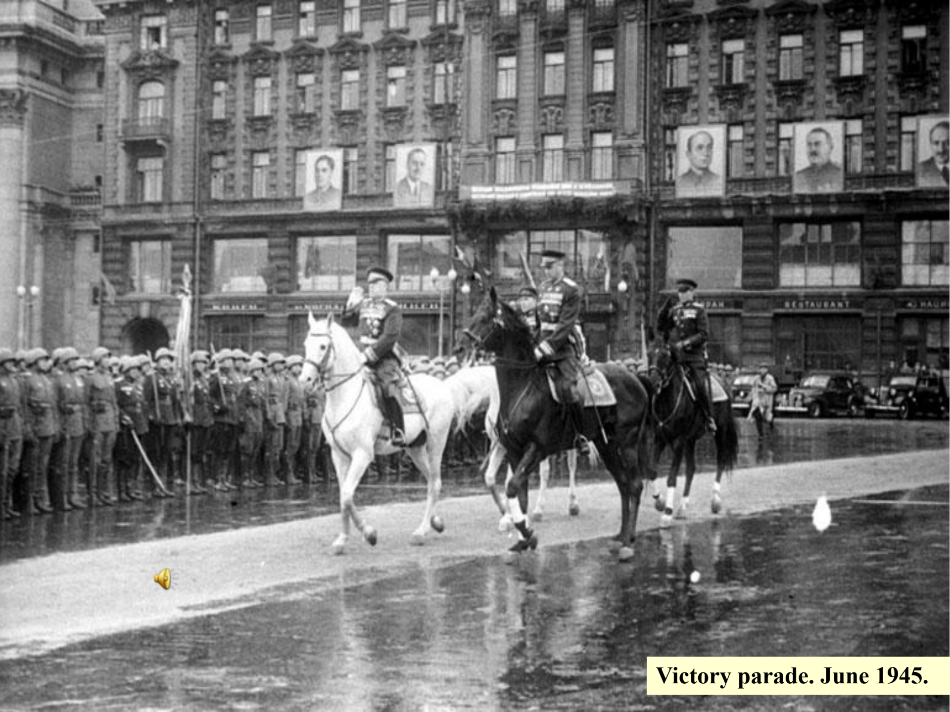
Victory parade. June 1945.