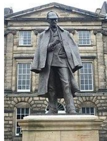
Sherlock Holmes statue in Edinburgh, erected opposite the birthplace of Doyle, which was demolished c. 1970

Doyle struggled to find a publisher for his work. His first work featuring Sherlock Holmes and Dr. Watson, A Study in Scarlet , was written in three weeks when he was 27 and was accepted for publication by Ward Lock & Co on 20 November 1886, which gave Doyle £25 (equivalent to £2,700 in 2019) in exchange for all rights to the story. The piece appeared a year later in the Beeton's Christmas Annual and received good reviews in The Scotsman and the Glasgow Herald