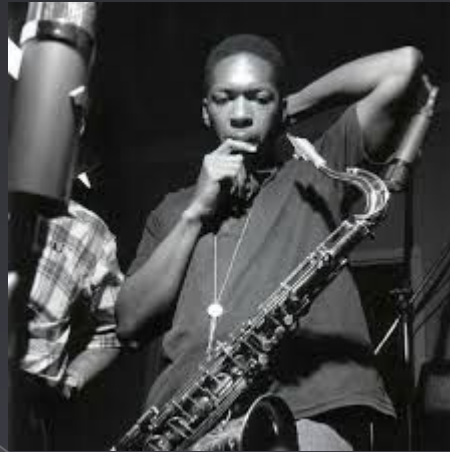
John Coltrane 1926-67