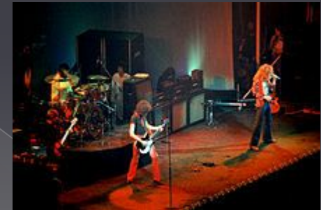
Led Zeppelin performing at Chicago Stadium in January 1975