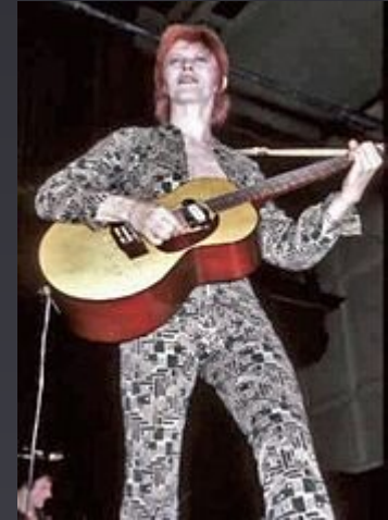
David Bowie during the Ziggy Stardust and the Spiders Tour in 1972