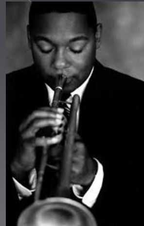
Wynton Marsalis 1961-