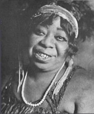
American blues singer Ma Rainey, was nicknamed the "Mother of the Blues".