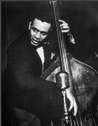
Charles Mingus 1922-79