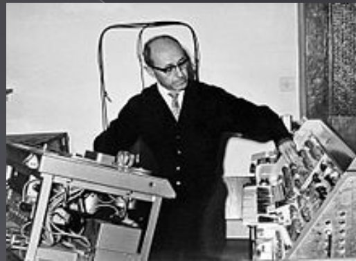
Israeli composer Josef Tal at the Electronic Music Studio in Jerusalem