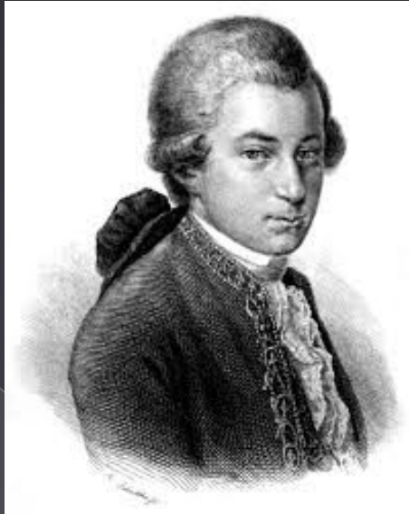
W.A. Mozart 1756-1791