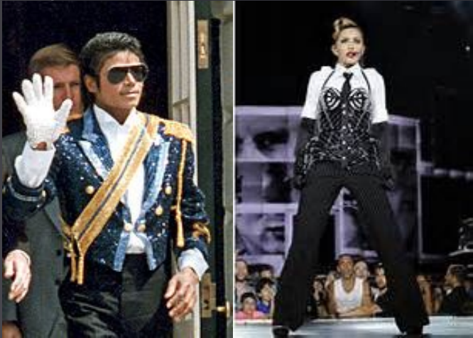
Michael Jackson and Madonna