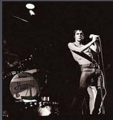
Iggy Pop, the "godfather of punk"