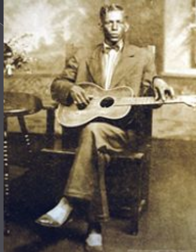
Charley Patton, one of the originators of the Delta blues style, playing with a pick or a bottleneck slide.