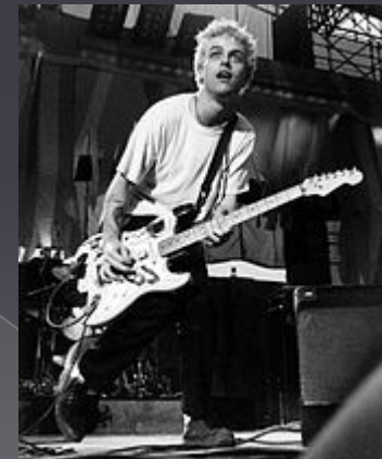
Billie Joe Armstrong of Green Day, performing in 1994