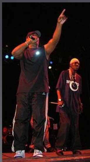
Public Enemy in 2006