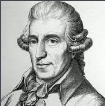
Franz Joseph Haydn 1732-1809