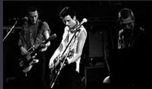
The Clash, performing in 1980