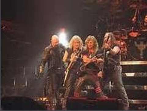
Judas Priest, performing in 2005