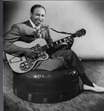
Jimmy Reed, pioneer in electric blues, who influenced Rolling Stones