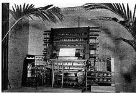
Telharmonium console, Thaddeus Cahill, 1897