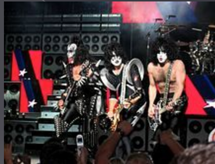
Kiss performing in 2004, wearing makeup