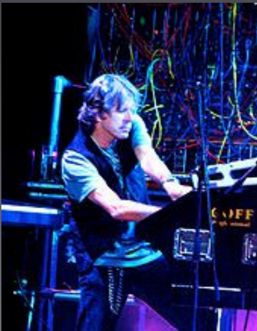
Keith Emerson performing in St. Petersburg in 2008