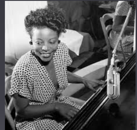
Mary Lou Williams 1910-81