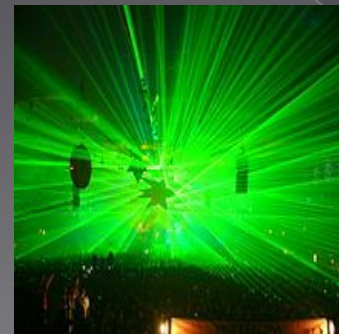
Klimax, an annual electronic music event that occurs in the Netherlands