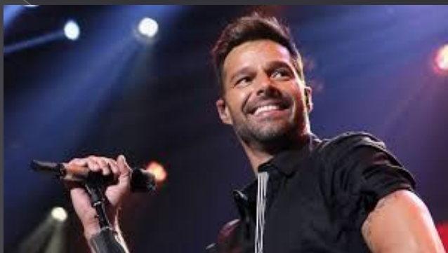
Ricky Martín ignited the 1990s Latin music explosion