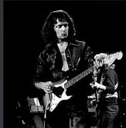
Ritchie Blackmore, founder of Deep Purple and Rainbow, known for the neoclassical approach in his guitar performances