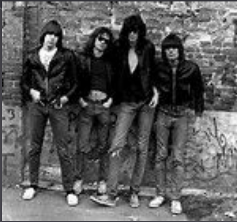
The Ramones' 1976