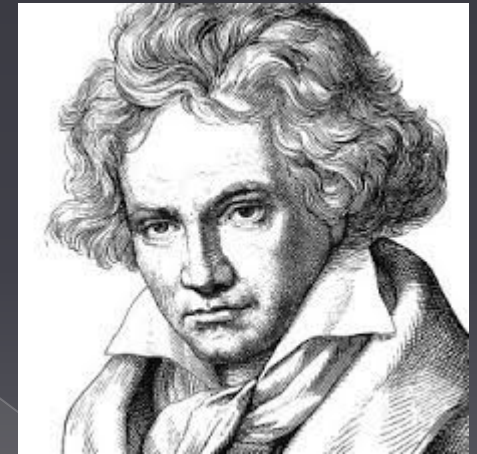
Ludwig van Beethoven 1770-1827