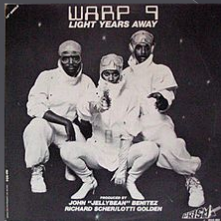
Warp 9 in Sci-Fi Spacesuits (1983)