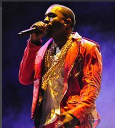
Kanye West achieved mainstream success in the 2000s