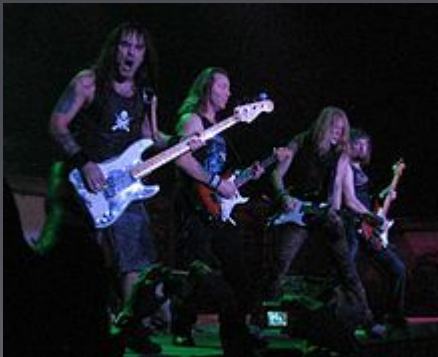
Iron Maiden, one of the central bands in the New Wave of British Heavy Metal