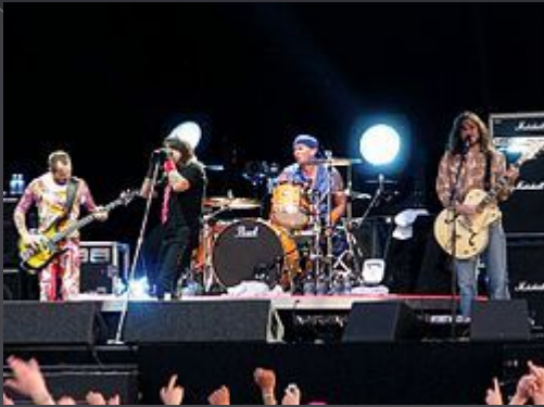
Red Hot Chili Peppers in 2006, showing a quartet lineup for a rock band