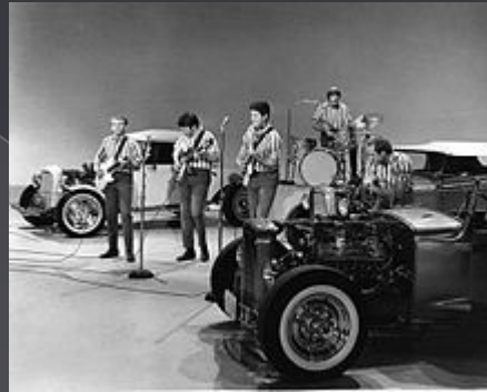
The Beach Boys performing in 1964