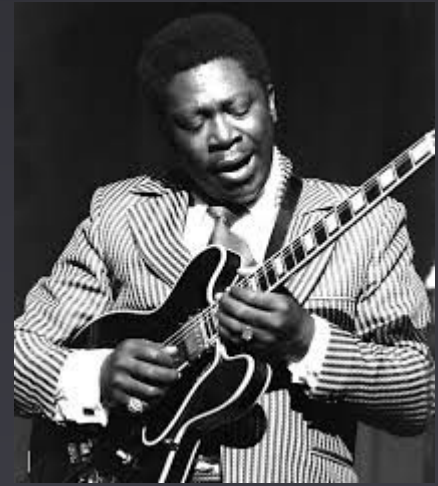
Blues legend B.B. King with his guitar, "Lucille".