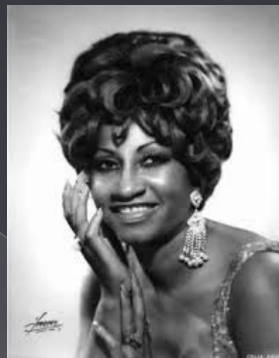
Celia Cruz The undisputable queen of salsa