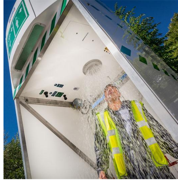
Tank Safety Showers