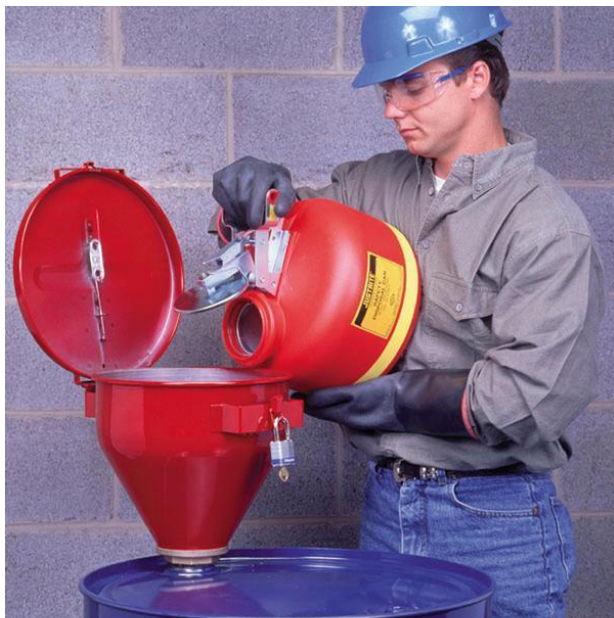
Drum Funnels and accessories