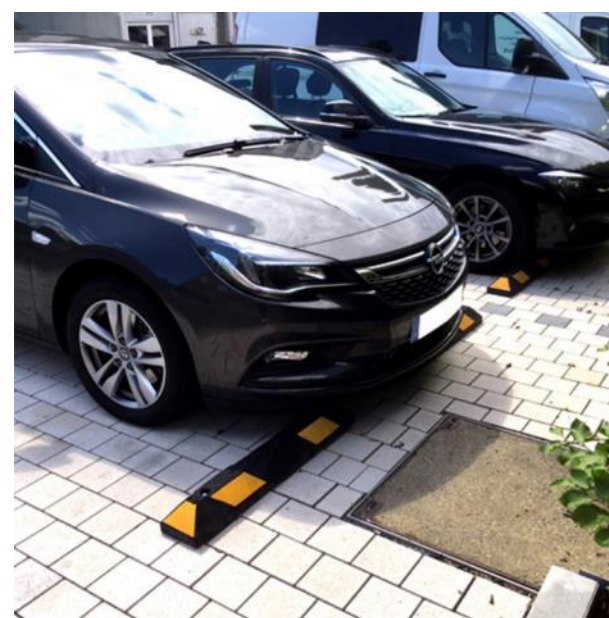
Traffic calming & parking lot solutions