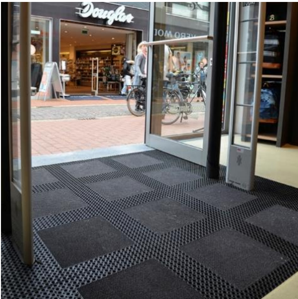
Outdoor entrance matting systems