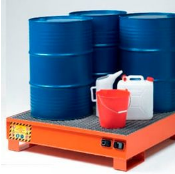
Pallets for drums and IBCs