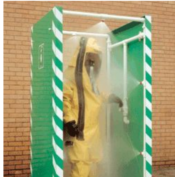
PPE Decontamination Showers