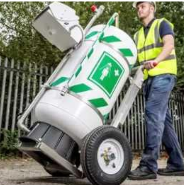
Mobile Safety Showers