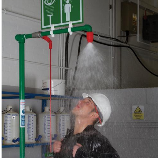
Indoor / Outdoor Safety Showers

HUGHES HUGHES-SAFETY.COM Justrite Safety Group