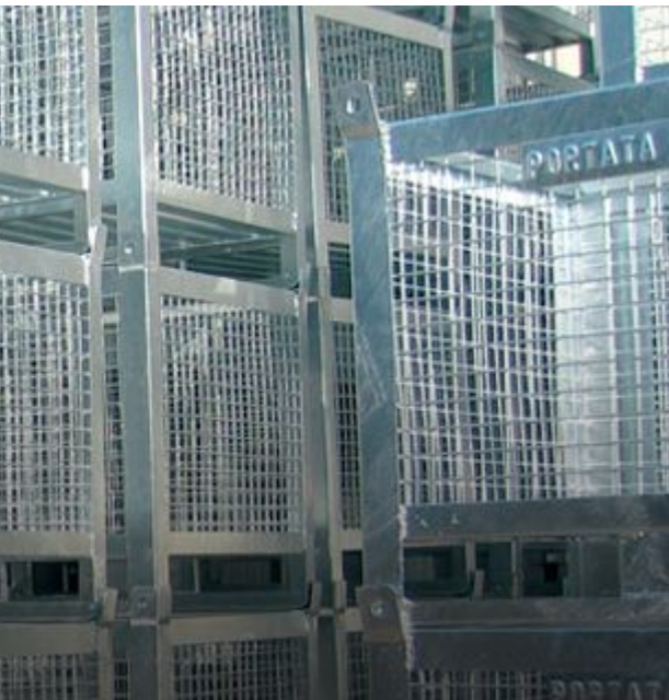
Modular containers for hazardous materials