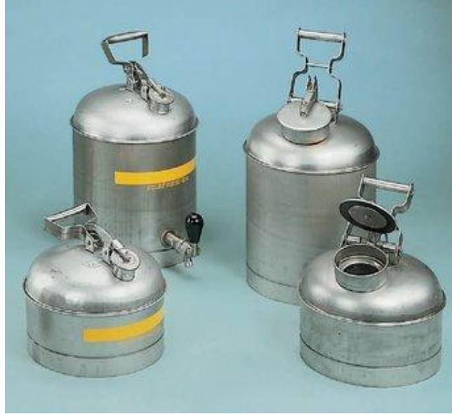
Stainless Steel Safety Cans