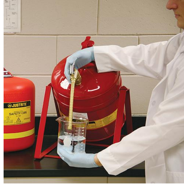
Safety Cans and Containers