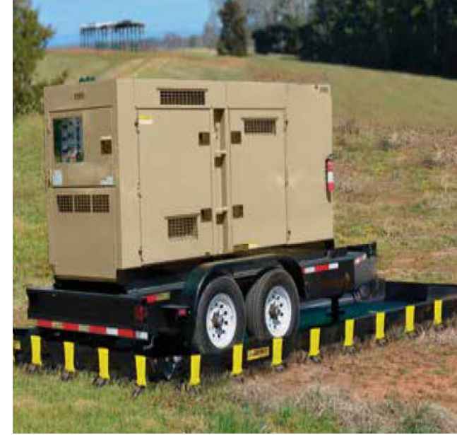
(Flexible) Spill Pallets