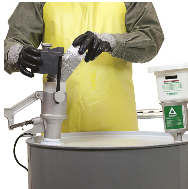
Aerosol recycling System