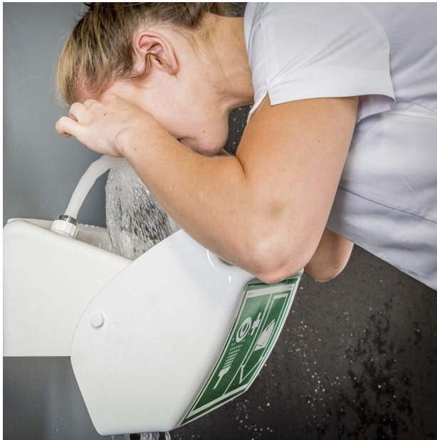
Emergency Eye/Face Wash Equipment