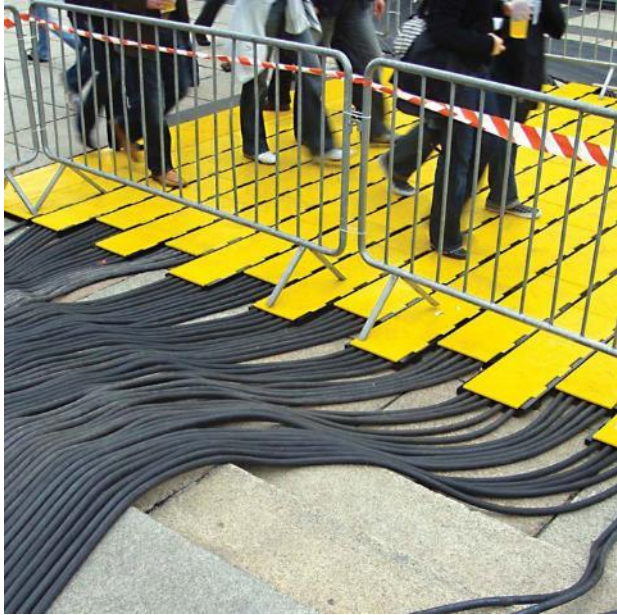
Cable management systems