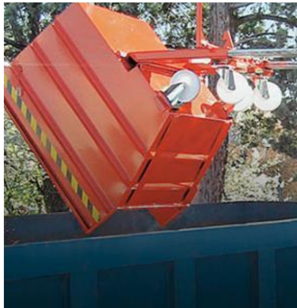
Collection, Safety & Waste Management