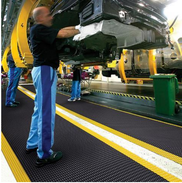
Ergonomic, anti-fatigue & safety mats