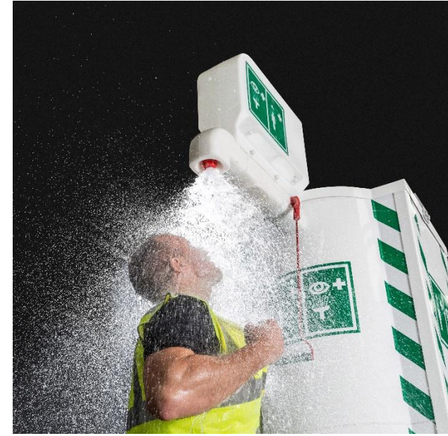
Temperature Controlled Safety Showers