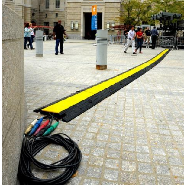
Multi-channel cable protectors