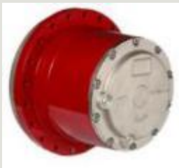
PMC 9000 Max torque 90.000 Nm