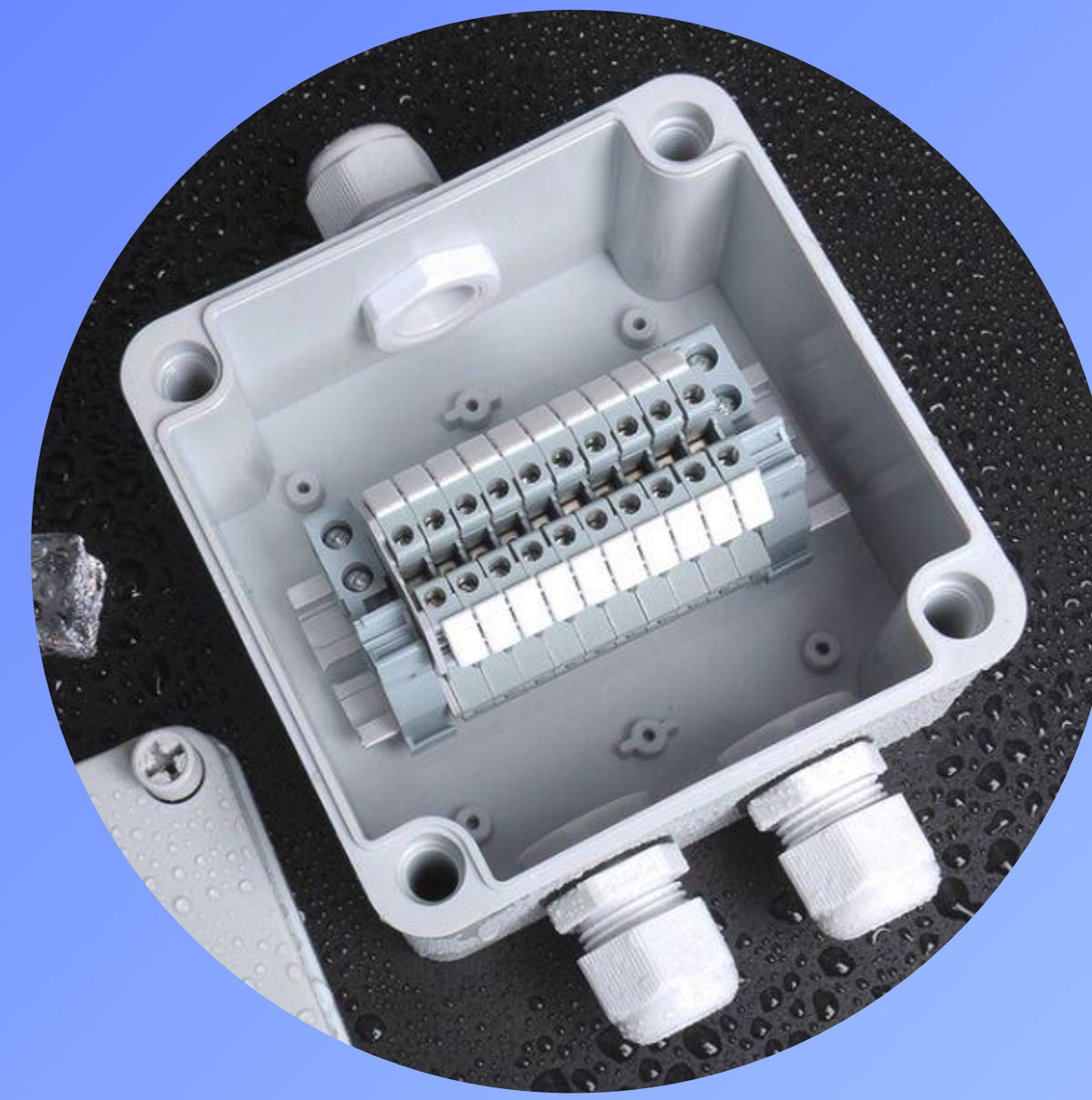
Weatherproof Junction Box