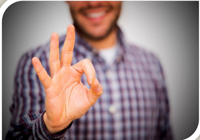
THE "OKAY" GESTURE