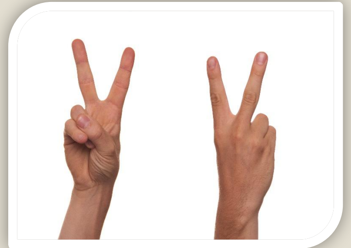
THE «V» SIGN