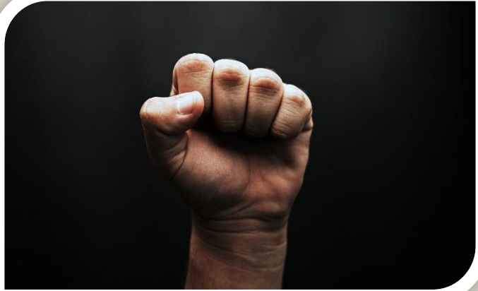
A CLENCHED FIST