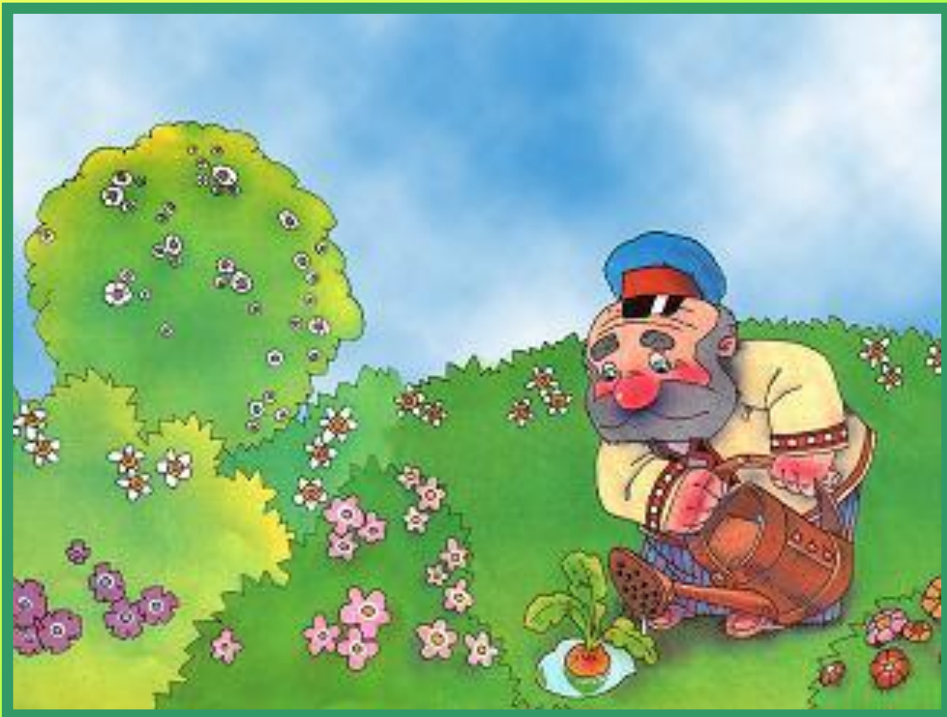
Grandpa planted a turnip.