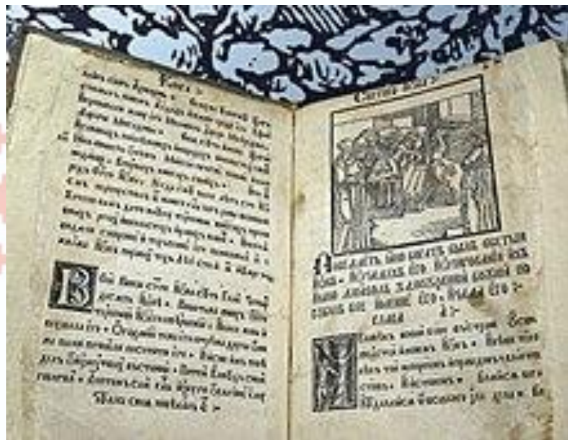
Pages of 1517 bible published by Scaryna