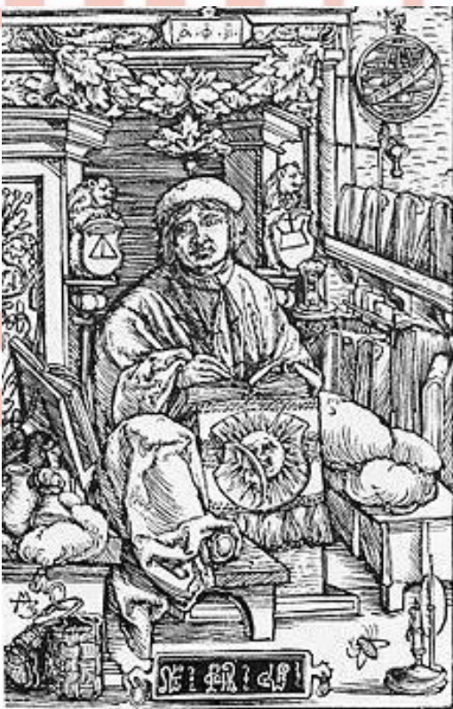
Franciscus Scorina, 1517