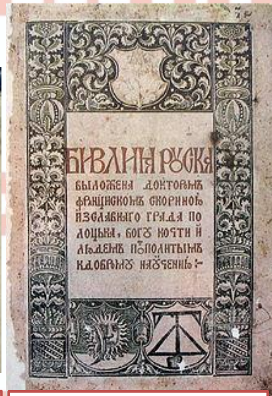
Title page of Skaryna's Bible