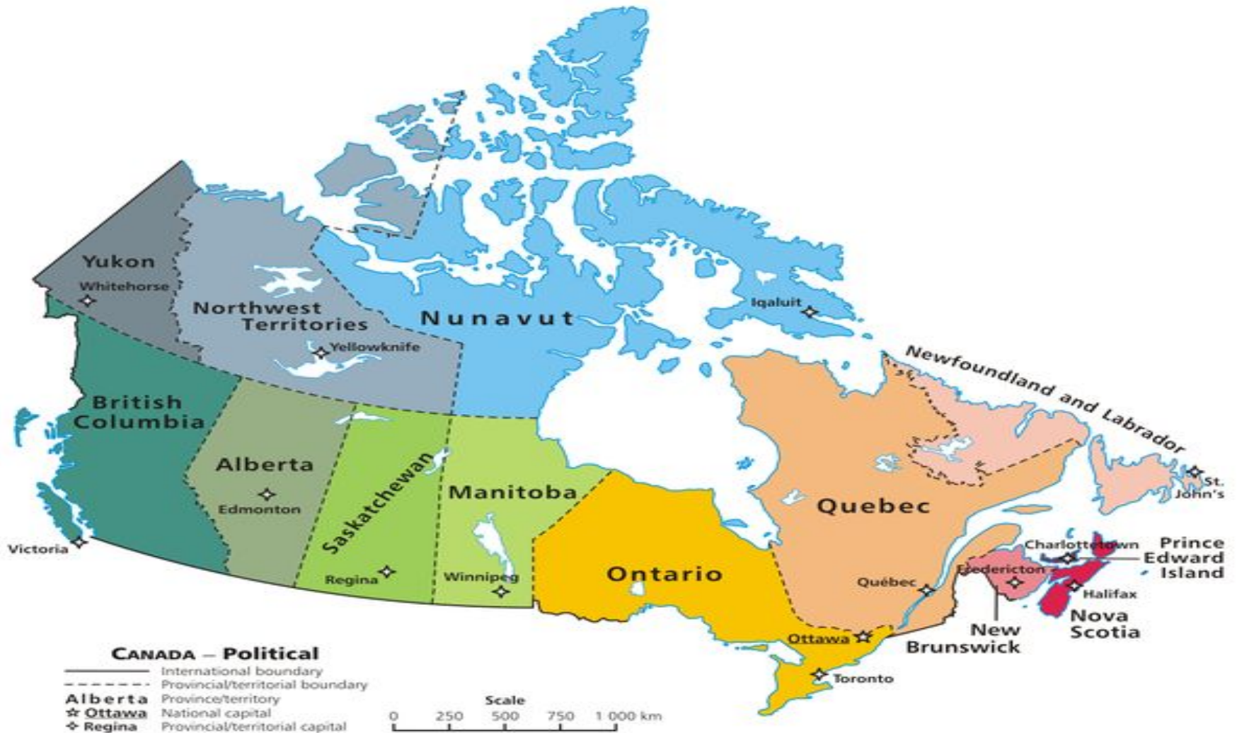
A map of Canada exhibiting its ten provinces and three territories, and their capital