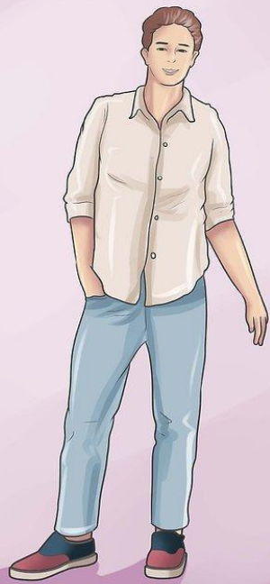
wikiHow to Dress for a First Date

3. If you're doing something less casual like a fancy dinner you'll want to wear something a little more dressy. Go for dress slacks in black or charcoal and a nice button down. If you're daring, maybe wear a vest. You probably don't need to wear a tie and a suit jacket unless you're going to one of the fancier restaurants in town.