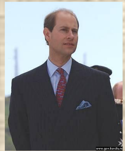
Prince Edward, the Earl of Wessex