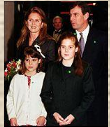
Prince Andrew, the Duke of Edinburgh, and his family

Elizabeth and Prince Philip have four children, Prince Charles, The Prince of Wales born on November 14, 1948, Princess Anne, now The Princess Royal born on August 15, 1950, Prince Andrew, the Duke of York was born on February 19, 1960, and Prince Edward, the Earl of Wessex born on March 10, 1964. They all support the Queen in her Royal Duties: work with charity organizations, travel around the UK and abroad with official visits.