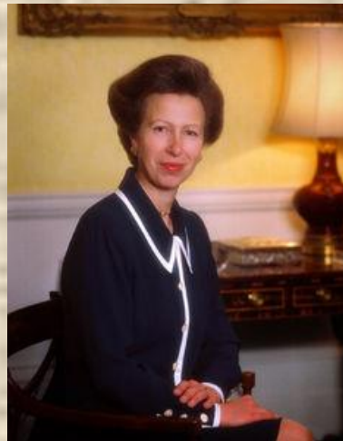
Princess Anne, The Royal Princess