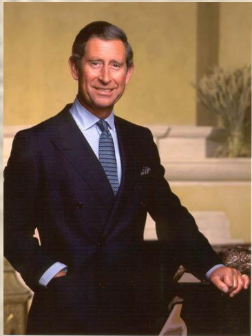
Prince Charles, The Prince of Wales