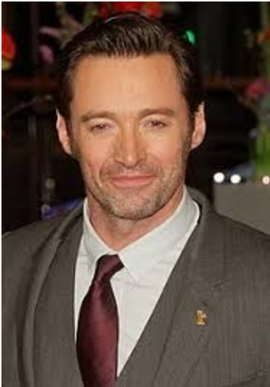
Hugh Jackman, actor