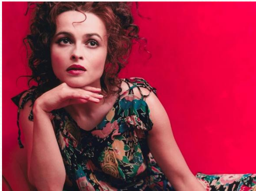
Helena Bonham Carter