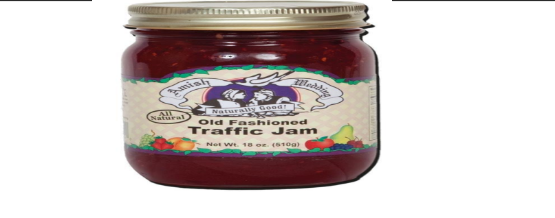
..... of jam.