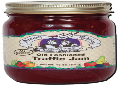
A jar of jam.