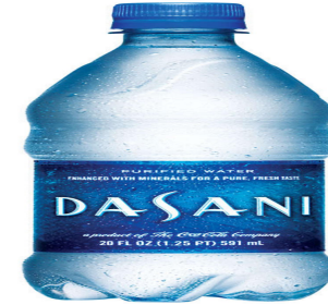
A bottle of water.