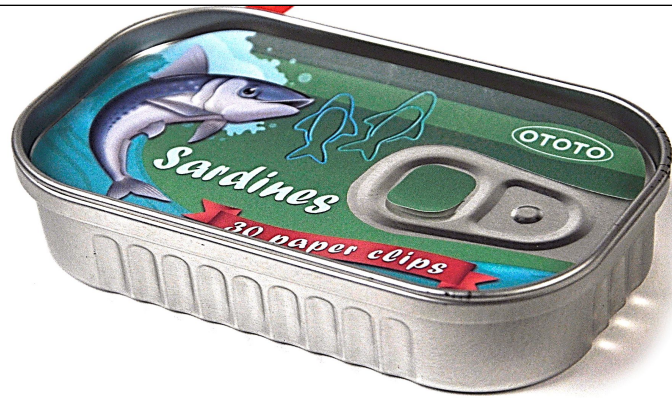
..... Of Sardines.