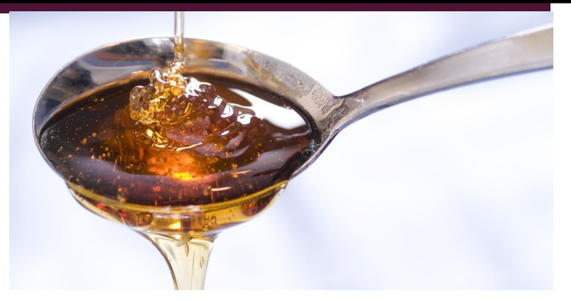
..... of honey.