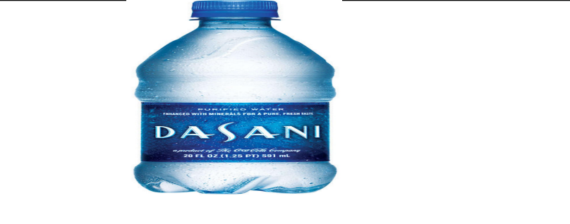
..... of water.