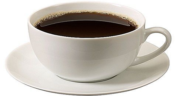
..... Of coffee.