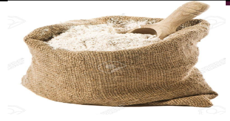
..... of flour.