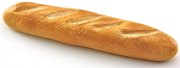
..... of bread.