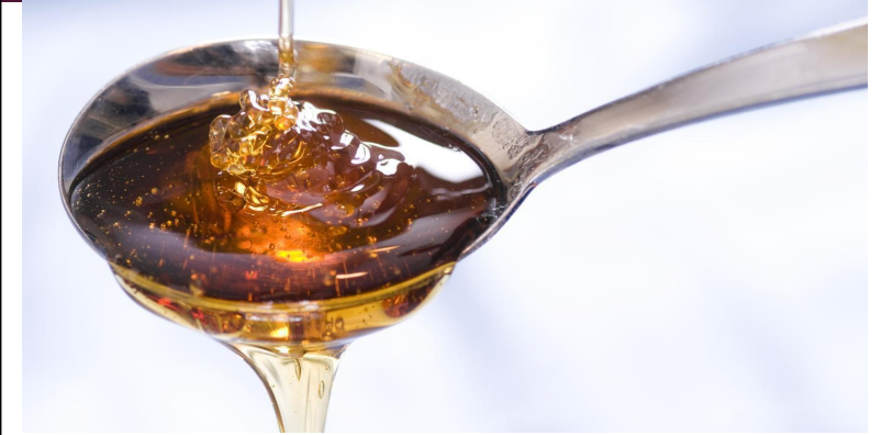
A teaspoon of honey.