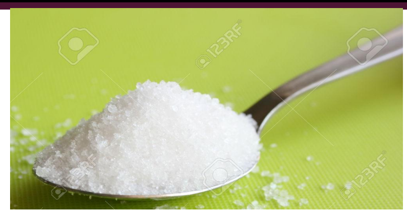
..... of salt.