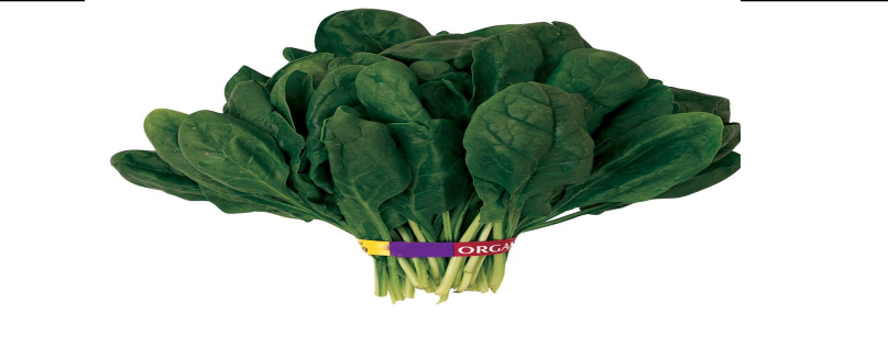
..... of spinach.