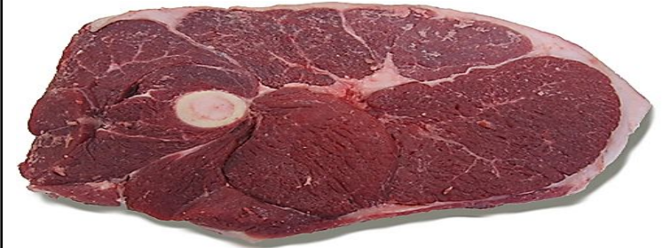
..... of meat.