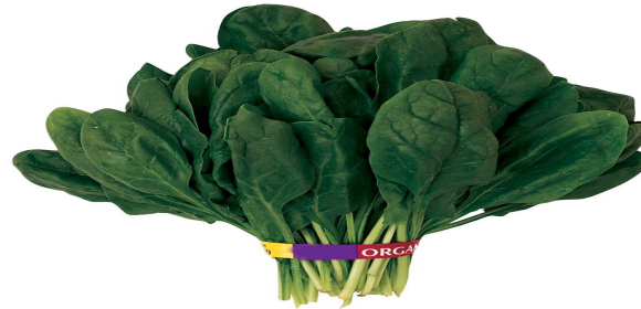
A bunch of spinach.