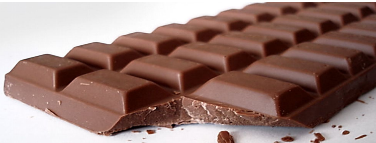
..... Of chocolate.