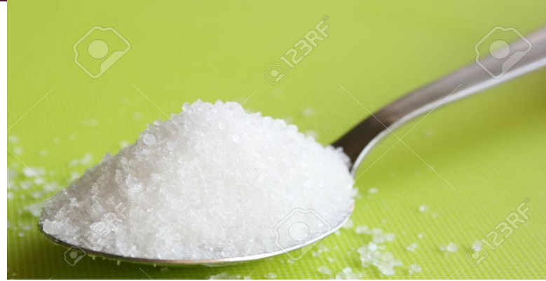
A spoonful of salt.