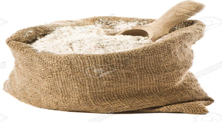
A bag of flour.