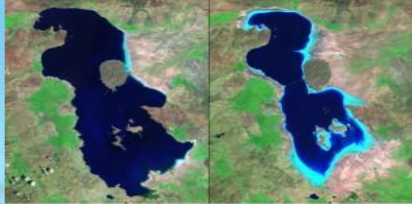
Lake Urmia. Left: 1985. Right: August 2010.

Vast forests are cut and burn in fire. Their disappearance upsets the oxygen balance. As a result some rare species of animals, birds, fish and plants disappear forever, a number of rivers and lakes dry up.