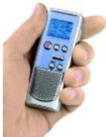
Dictaphone Device which is used to record voice