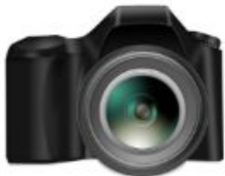
Photo camera Device which is used to capture images