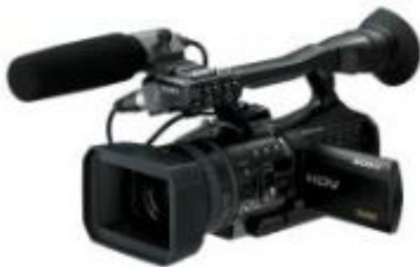
Video camera Is used to film video