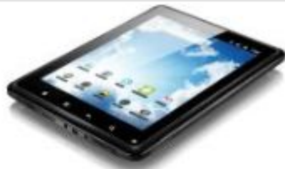
Tablet Is used to surf on the Internet and use it similar like laptop