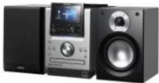
Stereo Is used to listen to the music