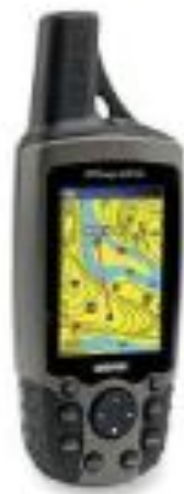
GPS Is a electronic map, which is used to track