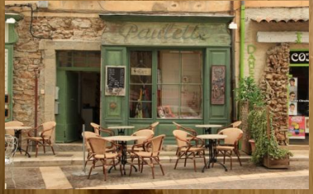
Places to eat