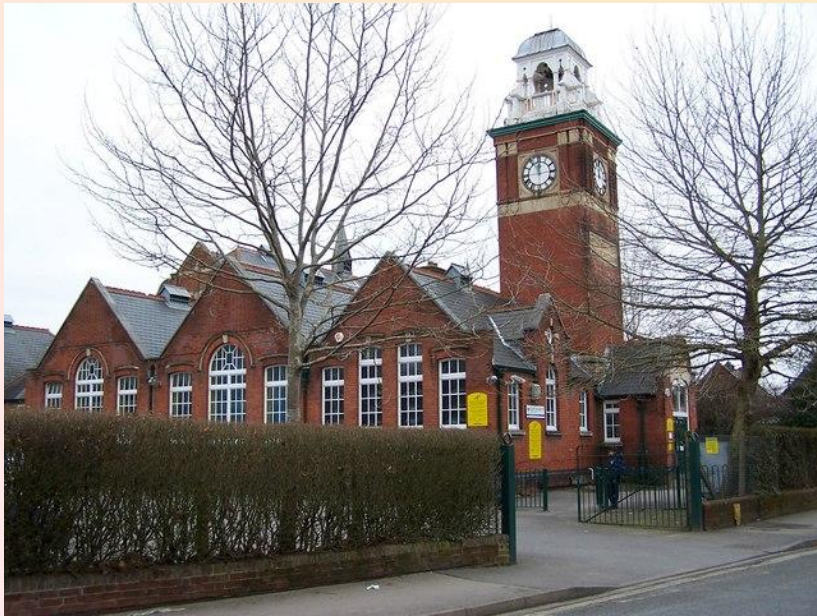
Mount Pleasant Junior School . Northam, Southampton, Great Britain