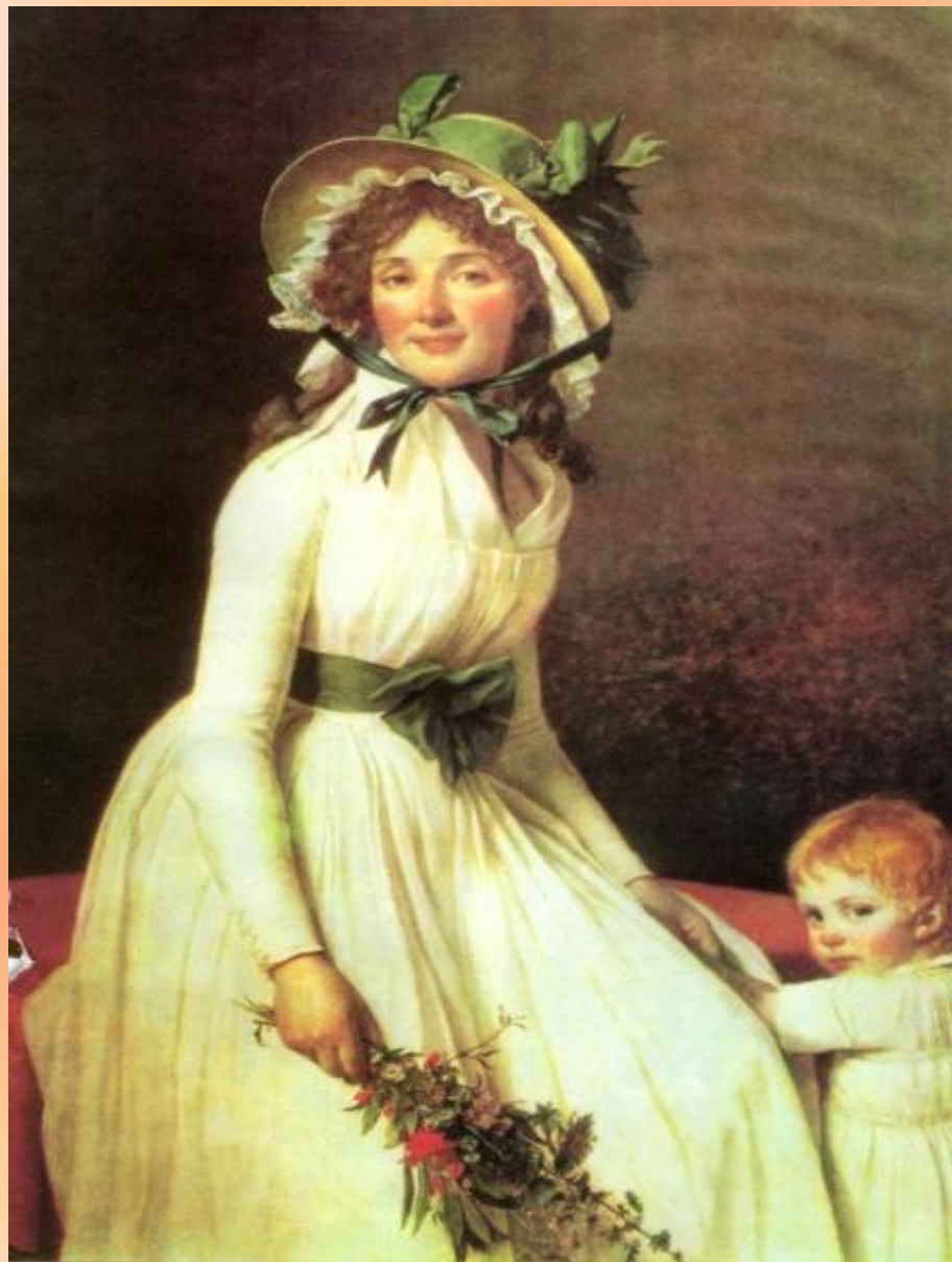
Портрет госпожи Серизиа.