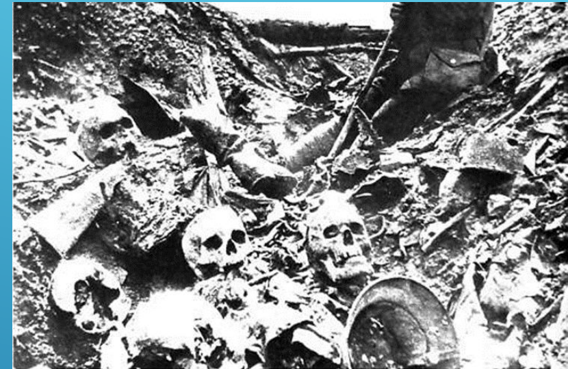
21348 Ghastly Mementos of Battle at Verdun—a Pile of Human Bones.