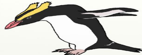
Erect-crested Penguin Eudyptes sclateri