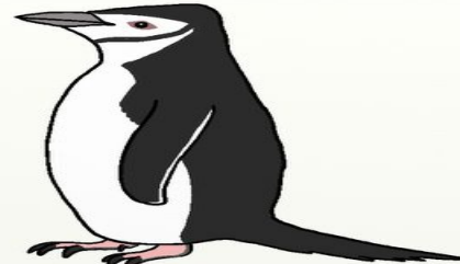
Chinstrap Penguin Pygoscelis antarctica