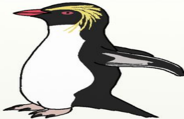
Northern Rockhopper Penguin Eudyptes moseleyi