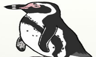
Humboldt Penguin Spheniscus humboldti