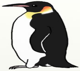
Emperor Penguin Aptenodytes forsteri