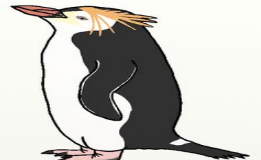
Royal Penguin Eudyptes schlegelii