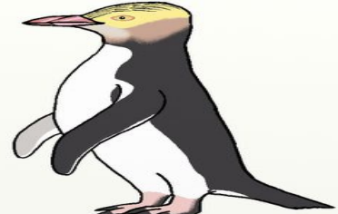
Yellow-eyed Penguin Megadyptes antipodes