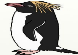
Macaroni Penguin Eudyptes chrysolophus