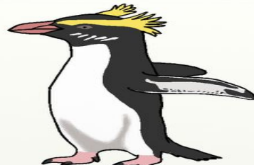
Fiordland Crested Penguin Eudyptes pachyrhynchus