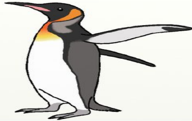
King Penguin Aptenodytes patagonicus