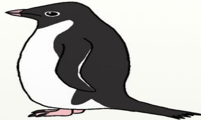
Adelie Penguin Pygoscelis adeliae