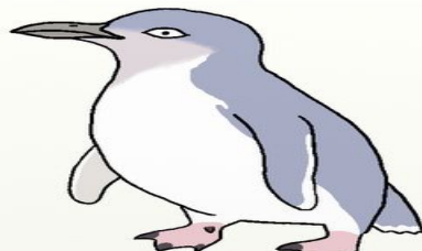
Little Blue Penguin Eudyptula minor