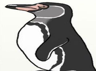
Galapagos Penguin Spheniscus mendiculus