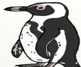
Jackass Penguin Spheniscus demersus