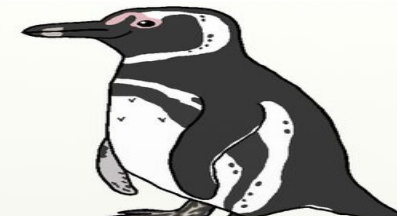
Magellanic Penguin Spheniscus magellanicus