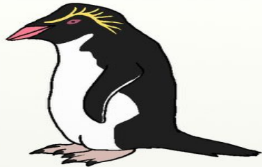
Southern Rockhopper Penguin Eudyptes chrysocome