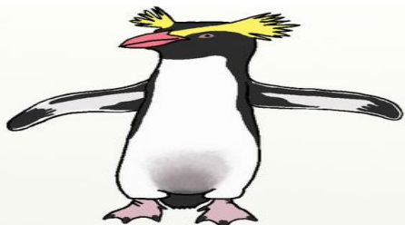
Snares Crested Penguin Eudyptes robustus