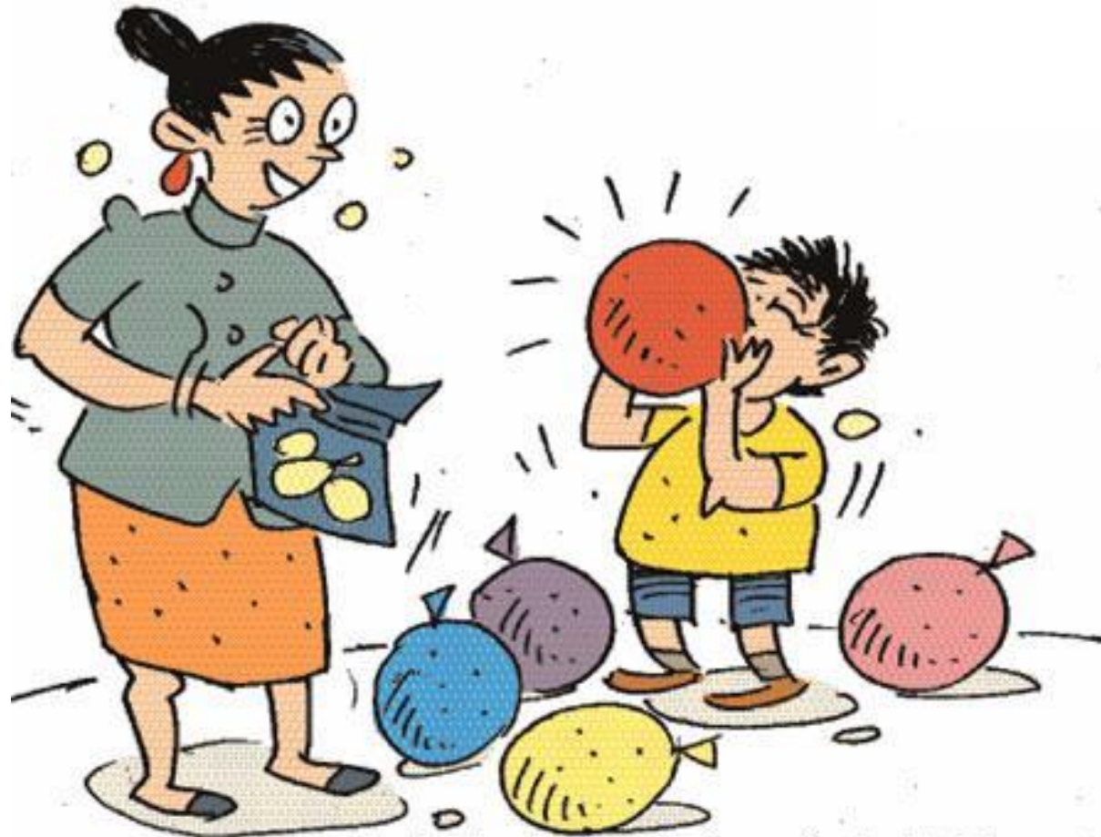
Mother has brought balloons for the birthday party.