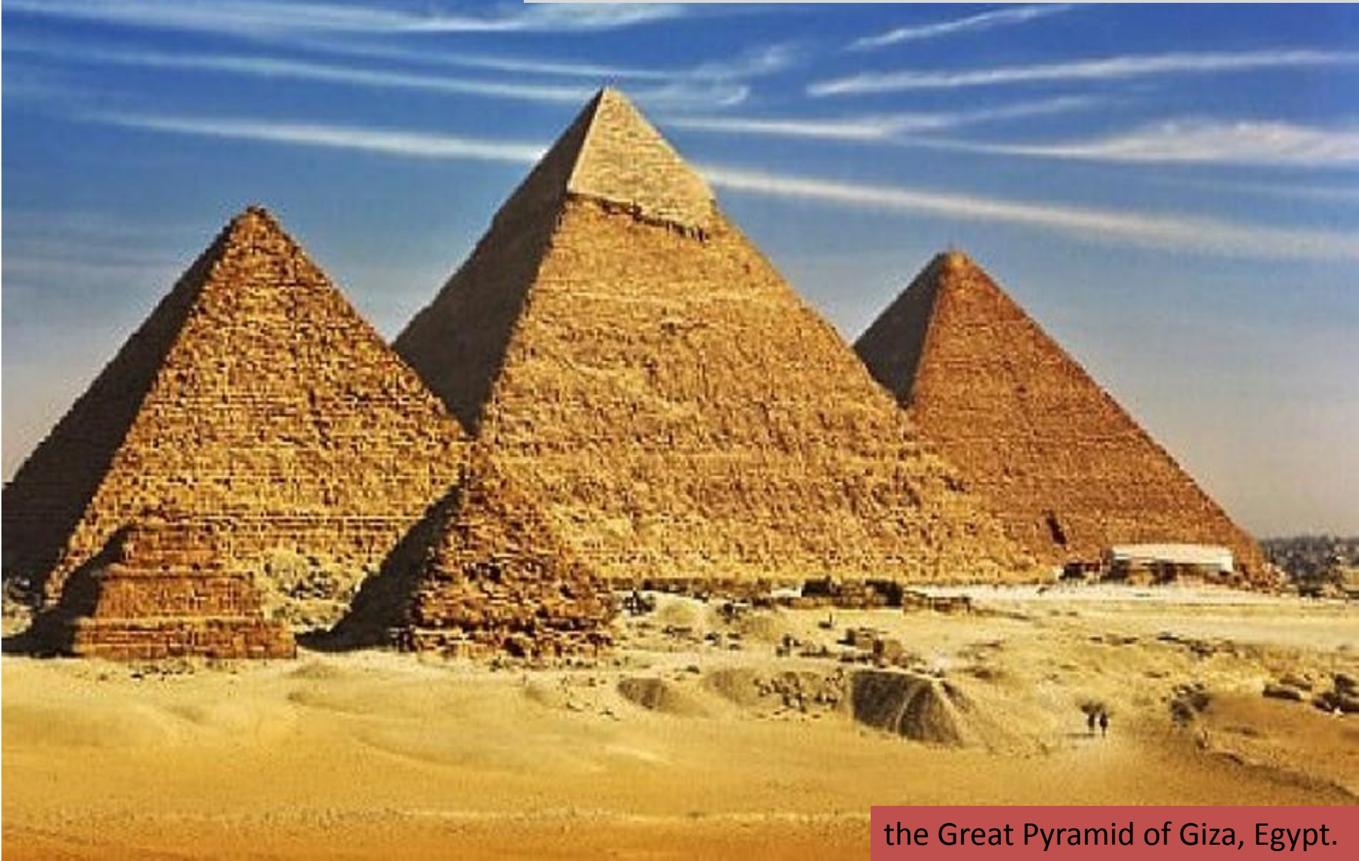
the Great Pyramid of Giza, Egypt.