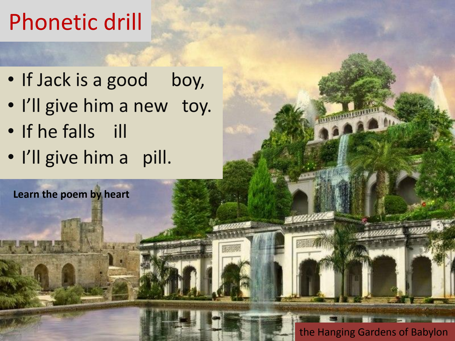
the Hanging Gardens of Babylon