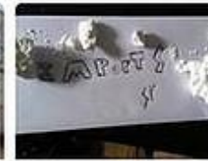
1/2g Cocaine $5.44