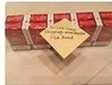
Red and White Filter (10 packs x 20 cigarettes) $1.90