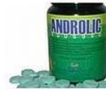
100 x Anadrol 50MG Oxymethotone (sealed ) $12.41