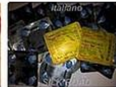
VEGA 100mg Sildenafil citrate 4 tablets $1.50