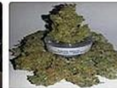
10 gram Santa Maria $11.58