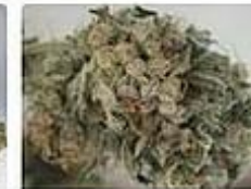
1/4 oz G13 $8.13