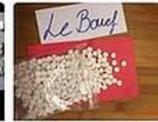
10 Pieces White Heart 130-150mg MDMA Content $4.49