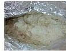
1 gram MDMA $5.89