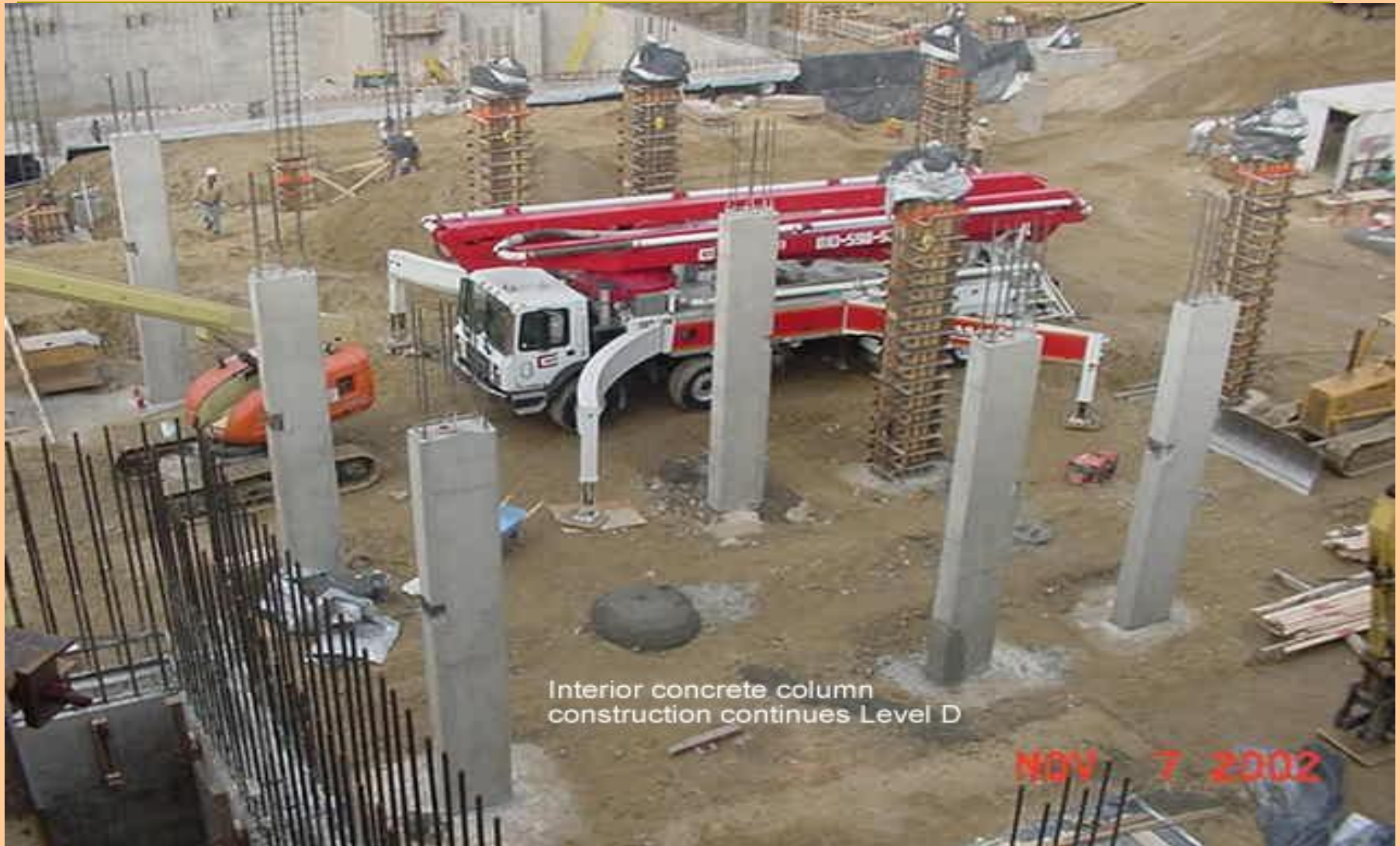
Interior concrete column construction continues Level D