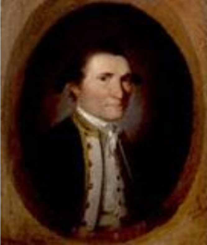
Portrait of Captain James Cook, by John Webber

Cook was an 18th century explorer and navigator whose achievements in mapping the Pacific, New Zealand and Australia radically changed western perceptions of world geography. As one of the very few men in the 18th century navy to rise through the ranks, Cook was particularly sympathetic to the needs of ordinary sailors.