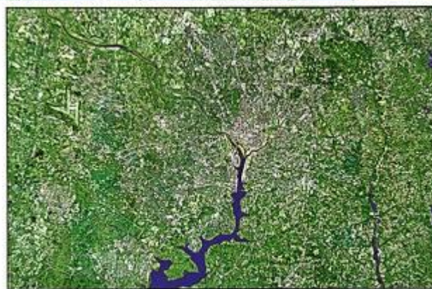
WASHINGTON D.C. FROM SPACE